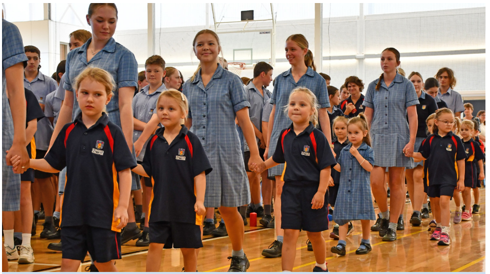
Our Year 12s proudly guided their Reception Buddies into the College Opening Mass.