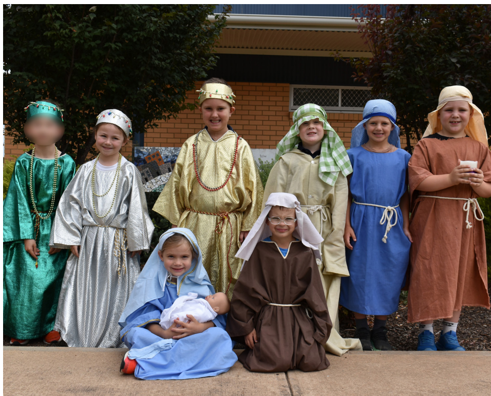
LITURGY > Our students in Reception Red and Green performed the story of the First Christmas for family and friends.

As we approach the end of another remarkable year, our hearts are filled with gratitude for the countless blessings that have enriched our lives and the unique journey we've embarked on together. The season of Advent provides us with a beautiful opportunity to reflect on the past, live in the present, and anticipate the promises of the future.