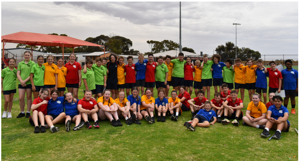
FAREWELL > We officially farewelled our Year 6 students at our End of Year Liturgy.