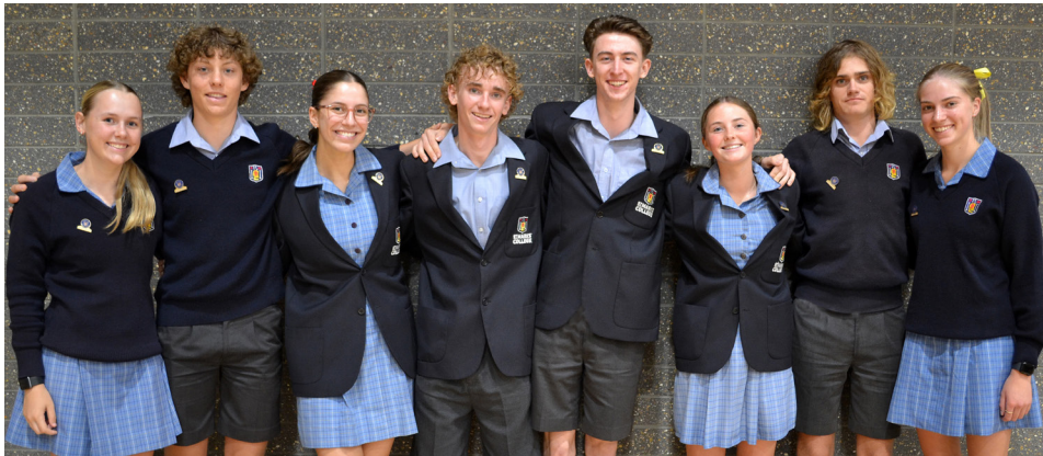
Our College leaders for 2023 and 2024 together for the last time!

See the full list of award winners on page 8.