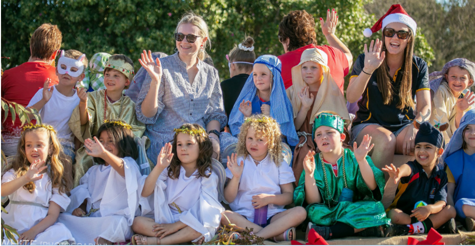
PAGEANT > Our students and staff were spreading the Christmas cheer at Saturday's Port Pirie Christmas Pageant!