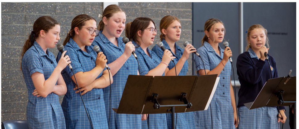
Our Bosco Vocal Group set the scene for a special night of celebration.