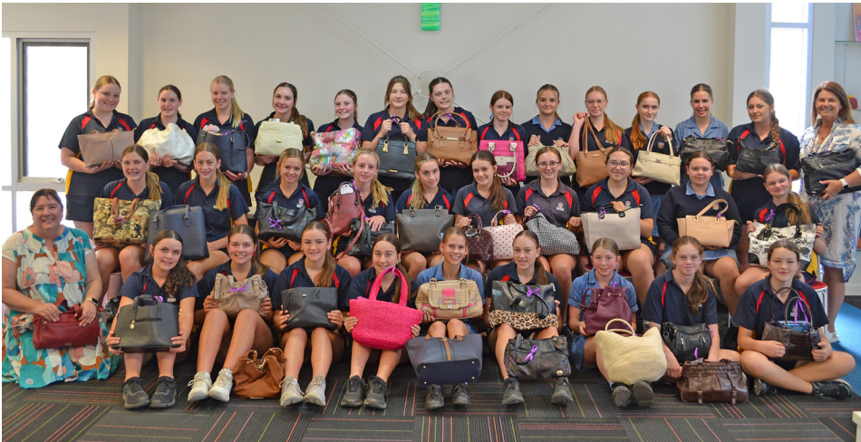
RITE JOURNEY > The Year 9 Rite Journey girls donated 63 bags full of essentials to local women in need.