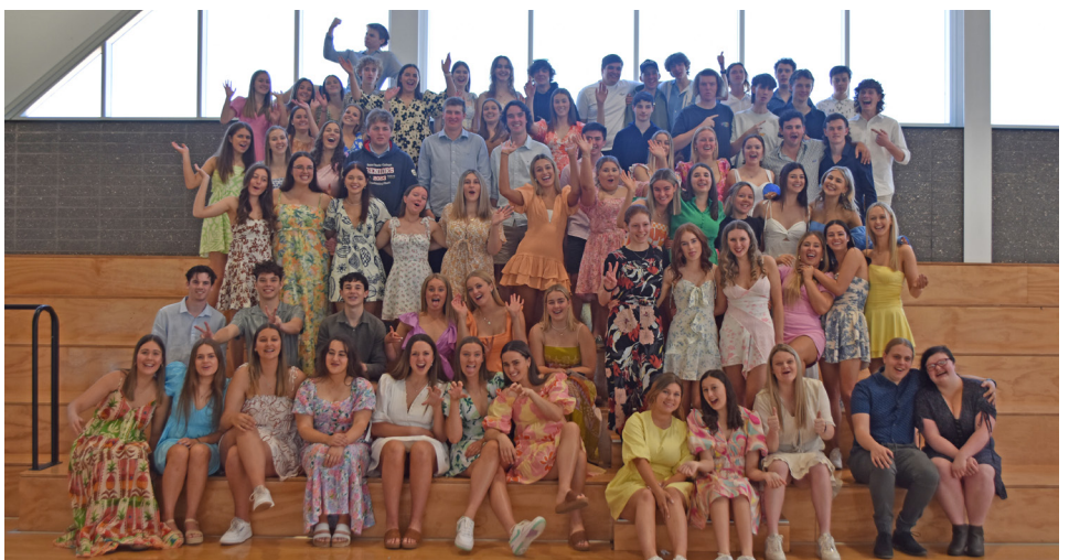
YEAR 12 > Celebrating the last day of school!