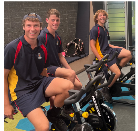
AFL > Year 10 students completing the 'Intergrated Learning- AFL' subject working on their general fitness.