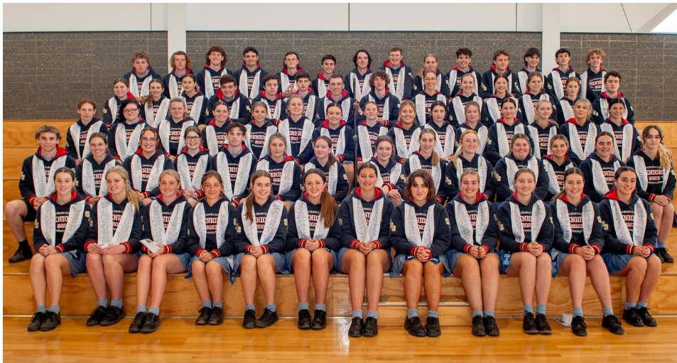
Congratulations to our Class of 2023!