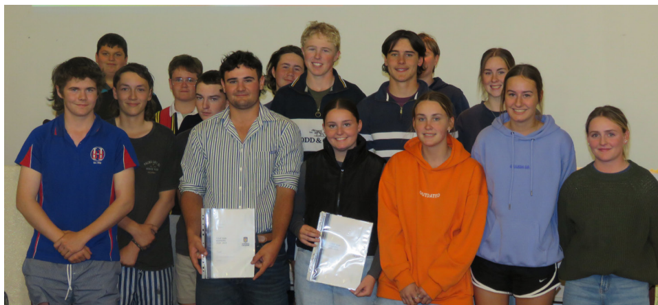
Our Salesian House Boarders celebrating the end of year.