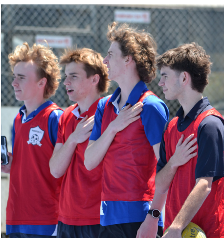
YEAR 12 > Pausing for the National Anthem before the soccer grand final.