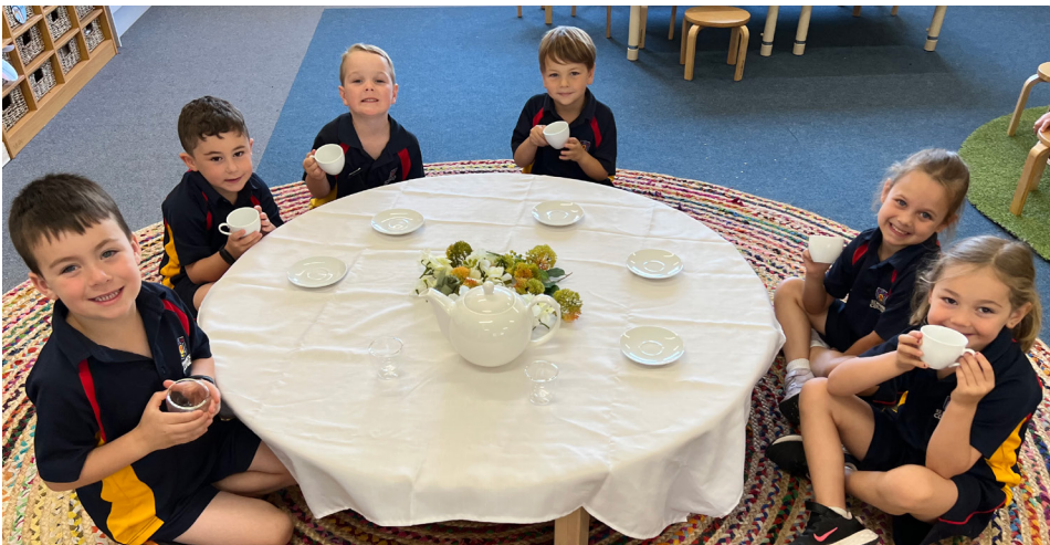
RECEPTION > Reception White students enjoying a tea party- an opportunity to help grow confidence, extend vocabulary, and develop a strong connection with one another.