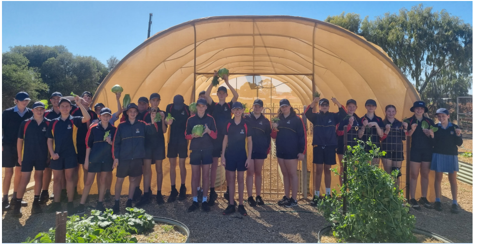
AGRICULTURE > Year 8 Agriculture students with the produce they have grown at McNally Farm.