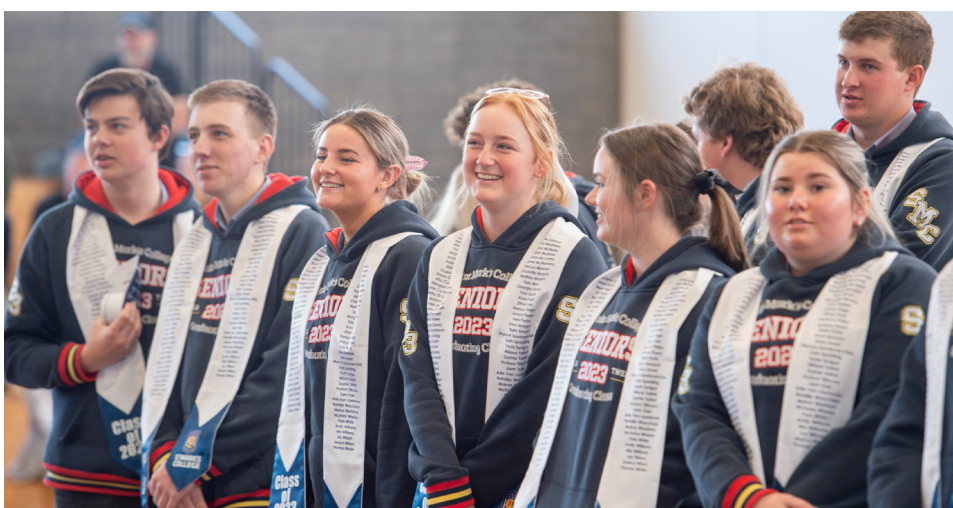
Shout to the Lord!