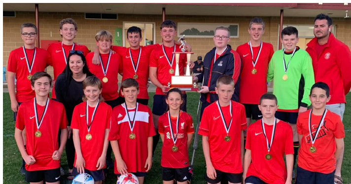
Junior High Premiers.