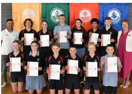
State and National Team selection or competition winners