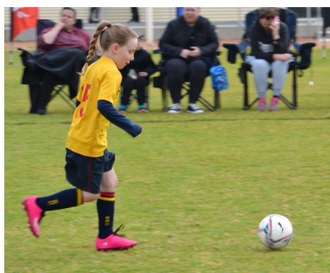
Ascha chases the ball.