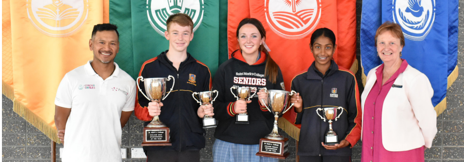
College Sports Council Award winners

Our Annual College Sports Assembly was held on Tuesday.