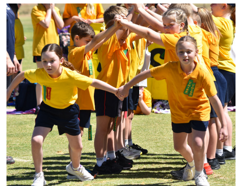
Dillon and Delta take off.