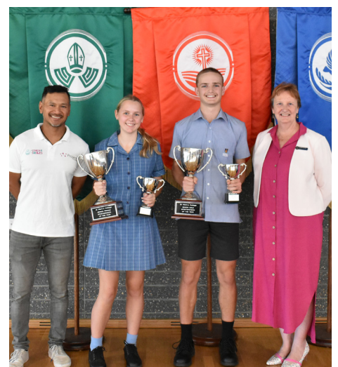
Senior Sports Council Award winners