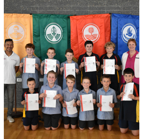
Students who represent St Mark's in 3 or 4 sports