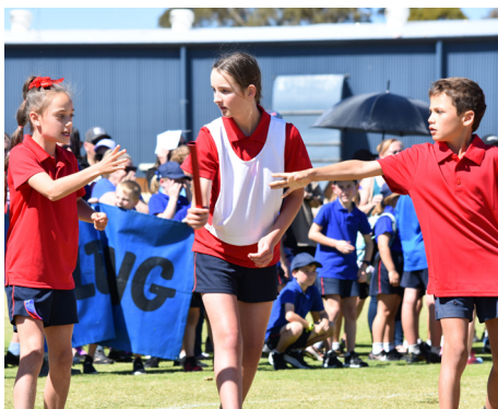
McNally pass the baton in Star Relay.