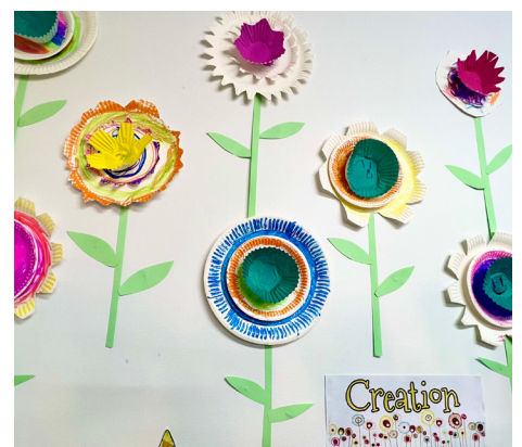
The season of creation-Reception Yellow created beautiful flowers.