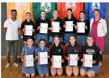
State and National Team selection or competition winners