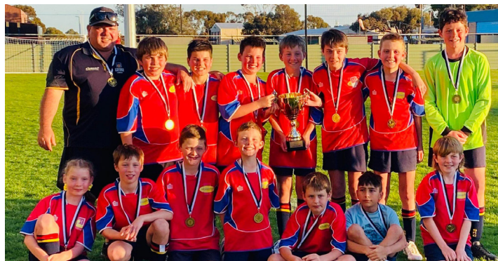
Primary Cup Final winners.