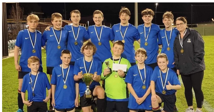
Junior High Cup Final winners.