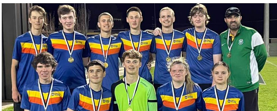
Senior High Premiers and Cup Final winners.