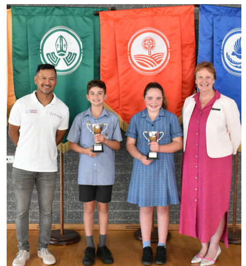
Junior Sports Council Award winners