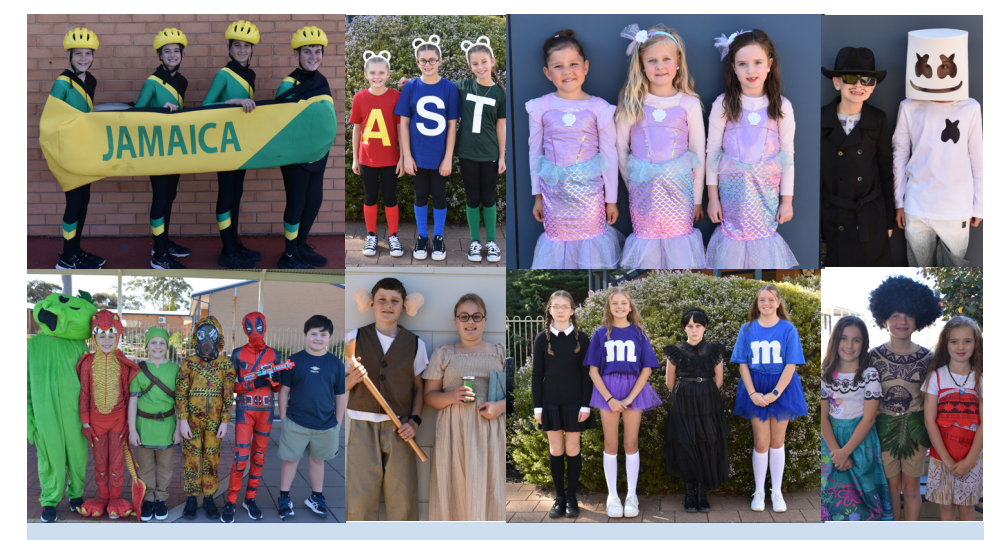
BOOK WEEK > We launched Book Week with our annual parade!