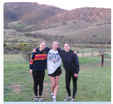
YEAR 8 > Orienteering, bushwalking, cultural experiences, and team-building games were all part of the fun of Year 8 Camp at Pichi Richi Park last week