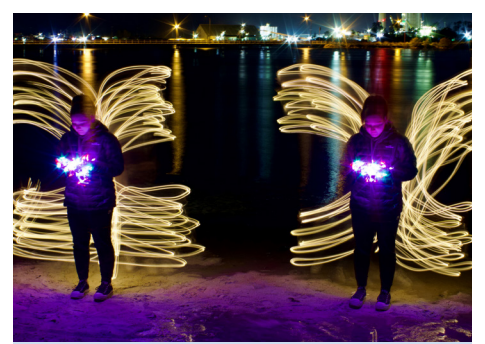
PHOTOGRAPHY > Our Stage 1 Photography class braved the cold to explore the photographic technique of "Painting with Light", producing some spectacular results. A big thank you to Lindall White for generously volunteering her time, knowledge and expertise!