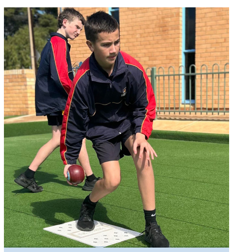
PE > Year 8s have been learning the skill of lawn bowling