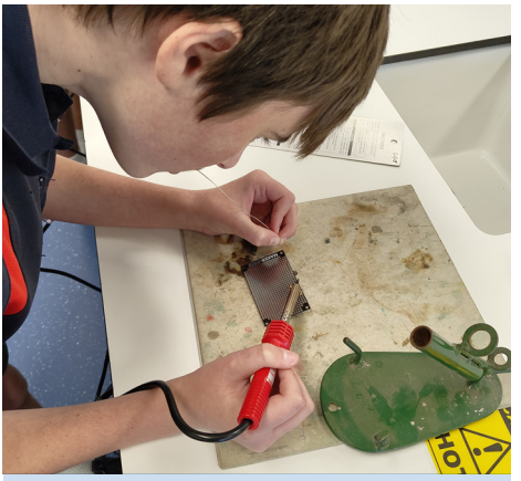
STEM > Year 9s have been learning 3D modelling and are designing cases for handheld games consoles. The first part of this process was learning to solder!