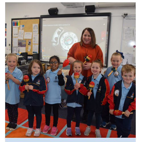
LITTLE LIONS > Our Little Lions tried a range of instruments in Music, Dance and Drama