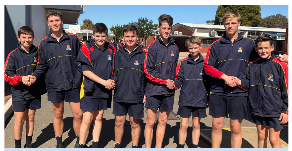
MENTORING > Over three lessons our Year 10 students have mentored our Year 7s, preparing various scenarios where students learnt strategies on how to manage conflict effectively