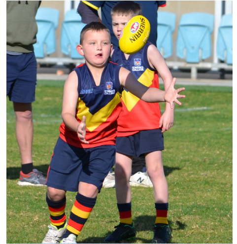
FOOTBALL > Beau takes possession of the ball