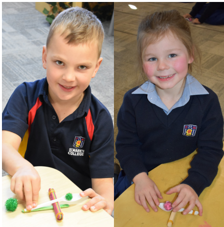
SCIENCE > 1Red made their own catapults and used them to launch pom-poms exploring the topic of force