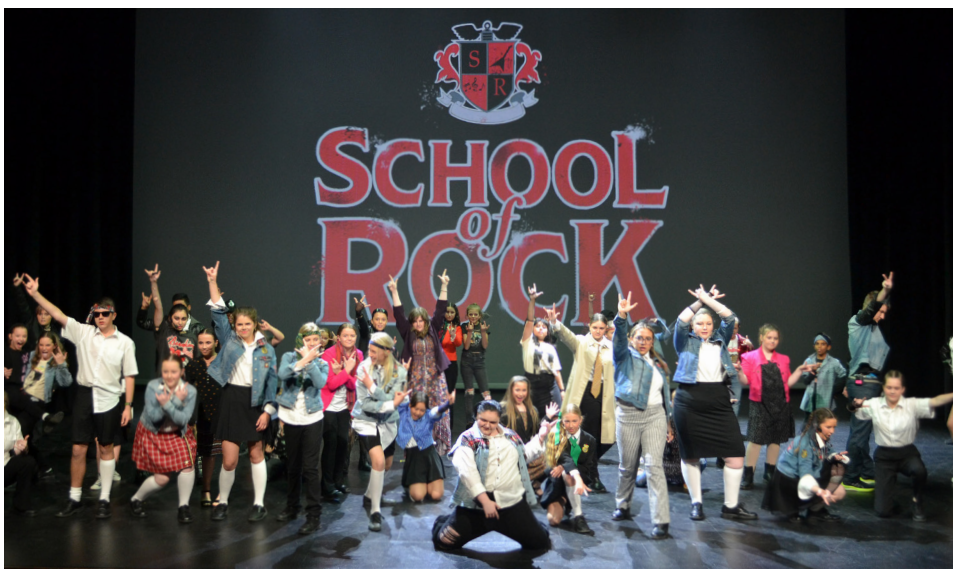
Our College production, the School of Rock, entertained audiences last week