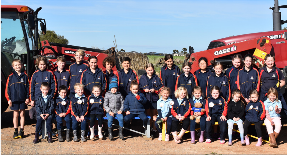
LITTLE LIONS > Our Little Lions and their Year 5 Buddies visited McNally Farm