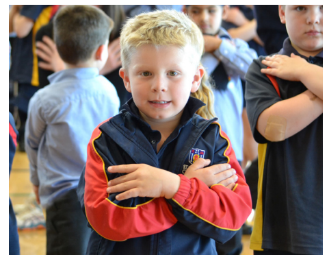
Archer receiving a blessing