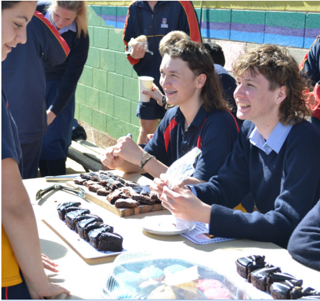
INTEGRATED LEARNING > Year 10 students created their own business idea, raising money for charity through the $20 Boss project