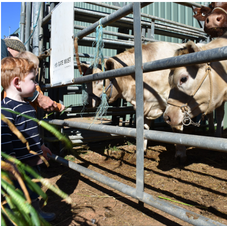
MINI MARK'S > Our Mini Mark's families visited McNally Farm during playgroup this week