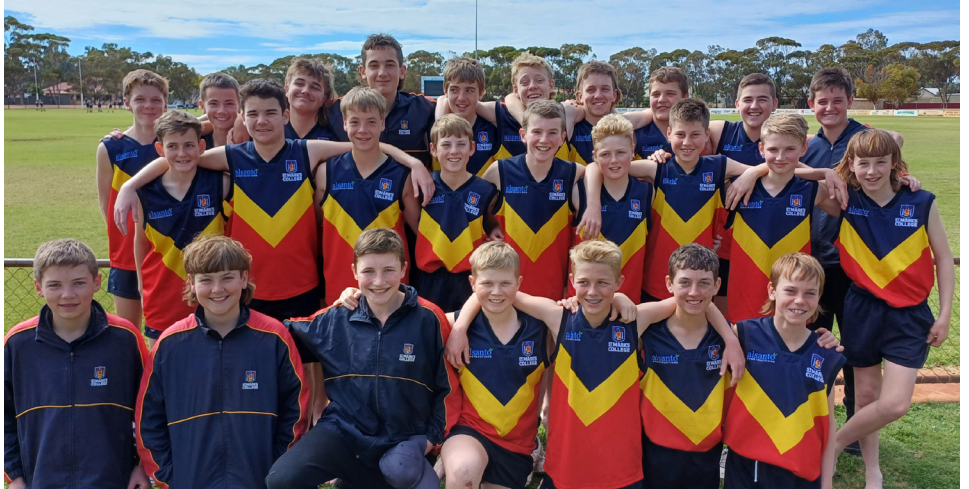
KNOCKOUT > Our Year 7 and 8 boys put in a great effort, finishing with a win and a loss at this weeks Knockout Football Competition