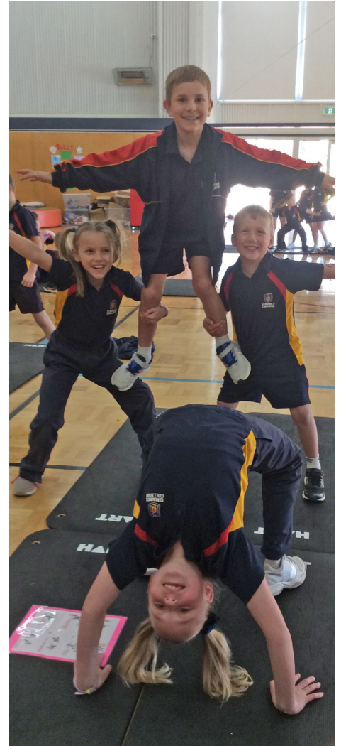
PE > Our Year 2s have been practicing and mastering their gymnastics balancing skills in PE