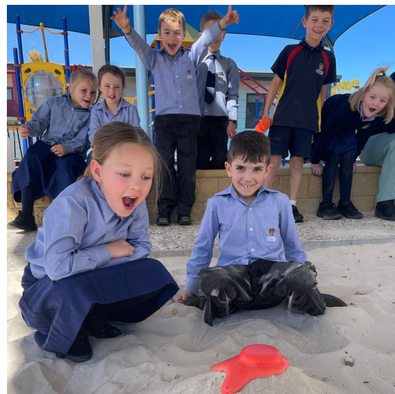
SCIENCE > 1Blue were excited to make exploding volcanoes during Science Week