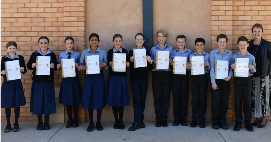
SUCCESS > Our Year 5s who were recognised for Academic Excellence at the Celebration of Success