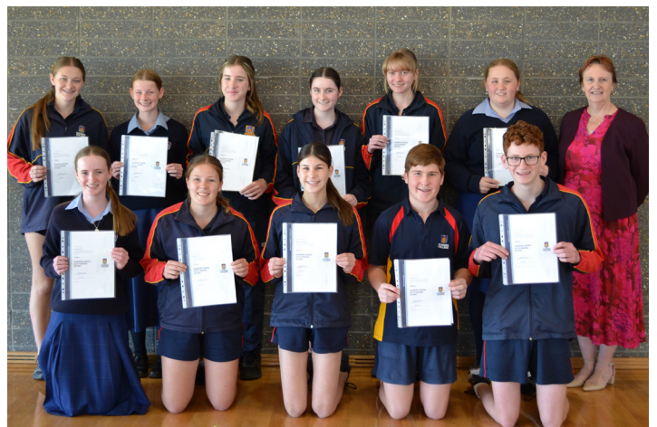
YEAR 10 > Students recognised for Outstanding Effort at the Celebration of Success