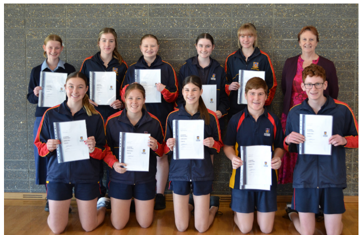
YEAR 10 > Students recognised for Academic Excellence at the Celebration of Success