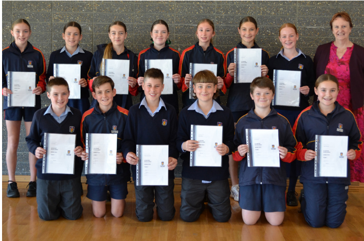
YEAR 7 > Students recognised for Academic Excellence at the Celebration of Success