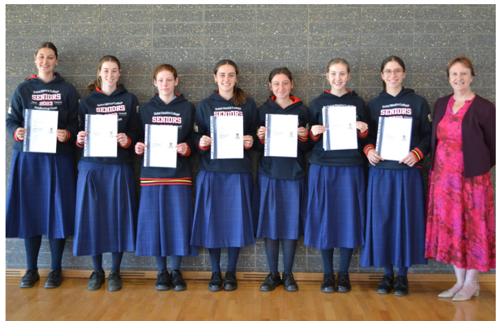
YEAR 12 > Students recognised for Outstanding Effort at the Celebration of Success