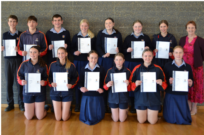
YEAR 9 > Students recognised for Academic Excellence at the Celebration of Success