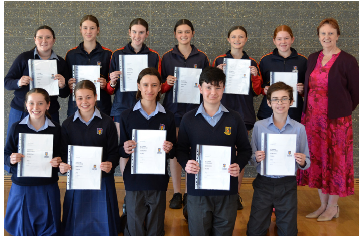
YEAR 8 > Students recognised for Academic Excellence at the Celebration of Success