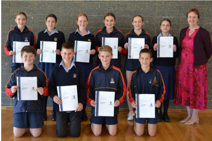
YEAR 7 > Students recognised for Outstanding Effort at the Celebration of Success