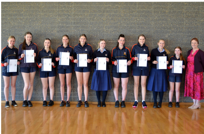
YEAR 11 > Students recognised for Academic Excellence at the Celebration of Success