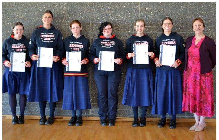
YEAR 12 > Students recognised for Academic Excellence at the Celebration of Success