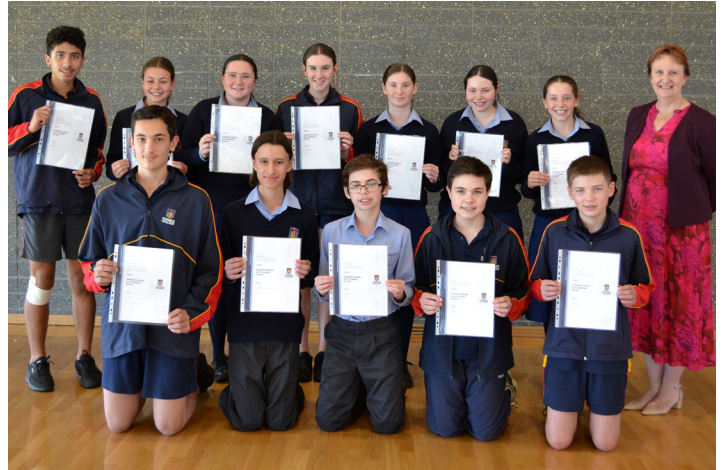
YEAR 8 > Students recognised for Outstanding Effort at the Celebration of Success