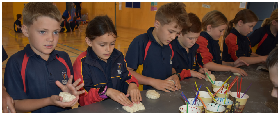
Our Year 4s making bread rolls using yeast at Year 4 Retreat recently

The Salesians of Don Bosco celebrate 100 years of their presence in Australia in 2023 and at St Mark's we have, and will continue to celebrate this milestone throughout the year. A centenary like this one is a great opportunity to reflect, in 1956 the Salesians of Don Bosco arrived and established a boy's secondary college, Salesian College and over the past 67 years the college has continued to live out the Salesian Charism as it evolved into the school it is today. Many changes have been made, but what has stayed the same is the spirit of Saint Don Bosco. Each day the staff prepare lessons and interact with students and each other knowing, 'education is largely a matter of the heart' that leads young people to "know that they are loved".