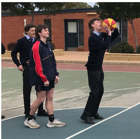
Shooting for goals