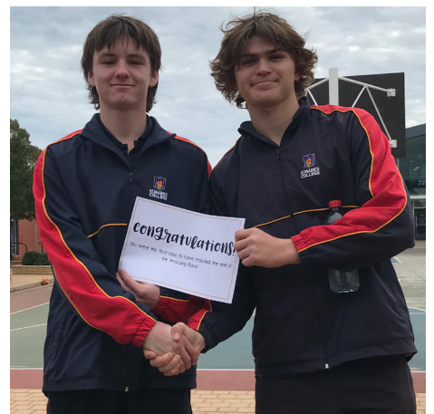
Winners are grinners!