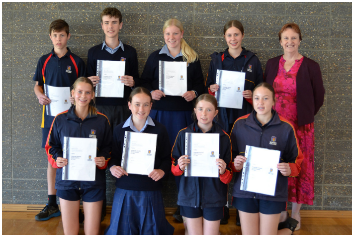
YEAR 9 > Students recognised for Outstanding Effort at the Celebration of Success