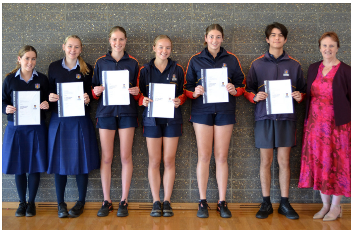
YEAR 11 > Students recognised for Outstanding Effort at the Celebration of Success