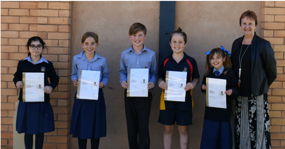
SUCCESS > Our Year 3s and 4s who were recognised for Academic Excellence at the Celebration of Success