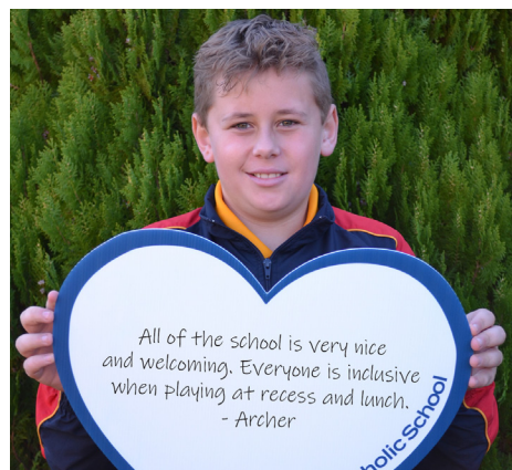
Students shared why they love their Catholic School during Catholic Education Week