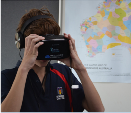
TECHNOLOGY > Across the College students have been using Virtual Reality glasses as part of their learning