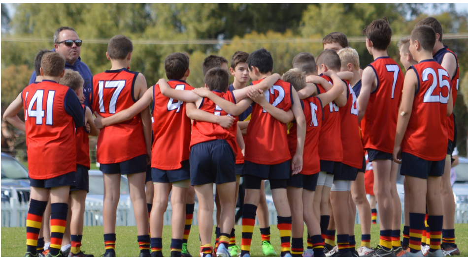
FOOTBALL > The football season is underway, pictured are our U13s team