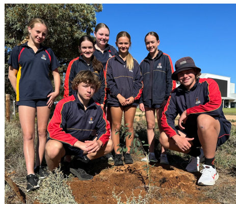
Year 9s planted a gum tree on behalf of all of the students in our College during Catholic Education Week