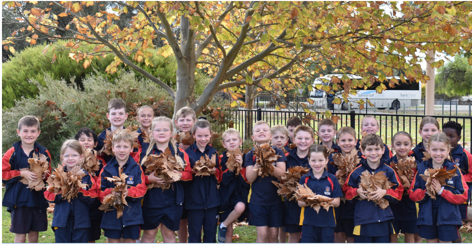
EXCURSIONS > 2B enjoyed their excursion walking through Wirrabara Forest and playing at Laura Playground