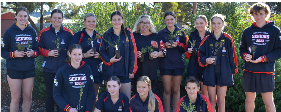
RECONCILIATION > Year 12 students raised money to purchase native plants for the Indigenous Garden. The Year 12s and Indigenous students collaborated together to plant these in preparation for Reconciliation Week.