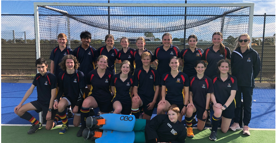
KNOCK OUT HOCKEY > Our Year 10-12 hockey team competed in knock out competitions recently and finished second on the day