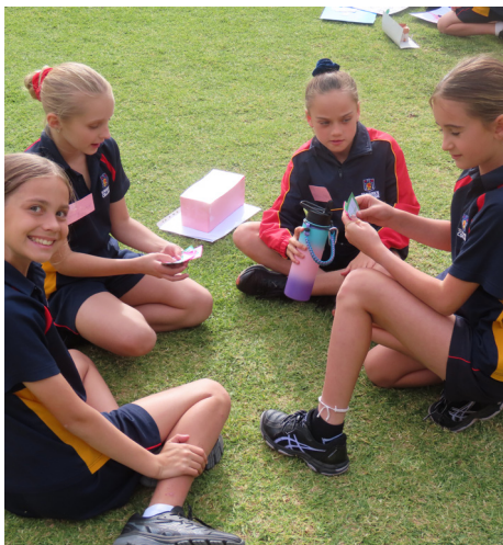
LITERACY > 5B AND 5G engaged in a number of spelling games recently