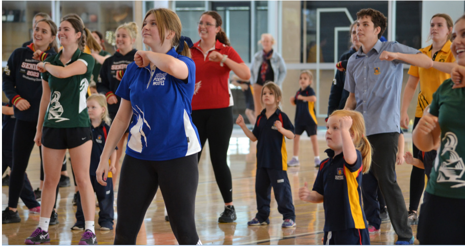
FEAST DAY > Our Year 12s and their Reception Buddies enjoyed busting some moves in the Sports Centre