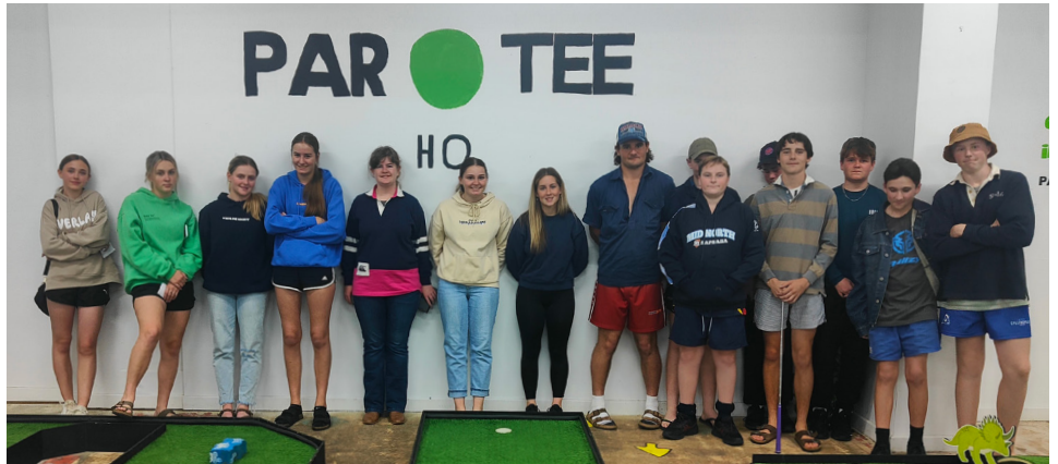
BOARDING > Our Boarders celebrated National Boarding Week with dinner out and a game of putt-putt at Par-tee HQ