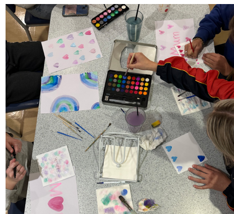
Boarders made Mother's Day cards using watercolour paints