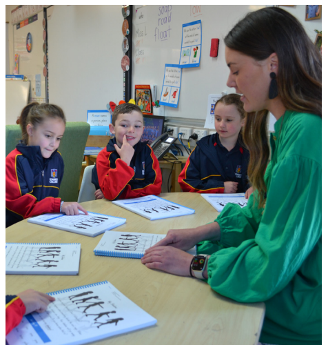
LITERACY > Literacy group work in 1 Blue