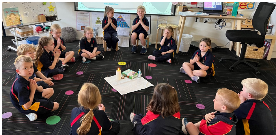
Morning prayer in the Reception Blue classroom