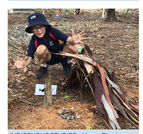
INDIGENOUS STUDIES > Year 4 Blue have been learning about different elements of Indigenous life, pictured is Luka with is model of an Indigenous shelter