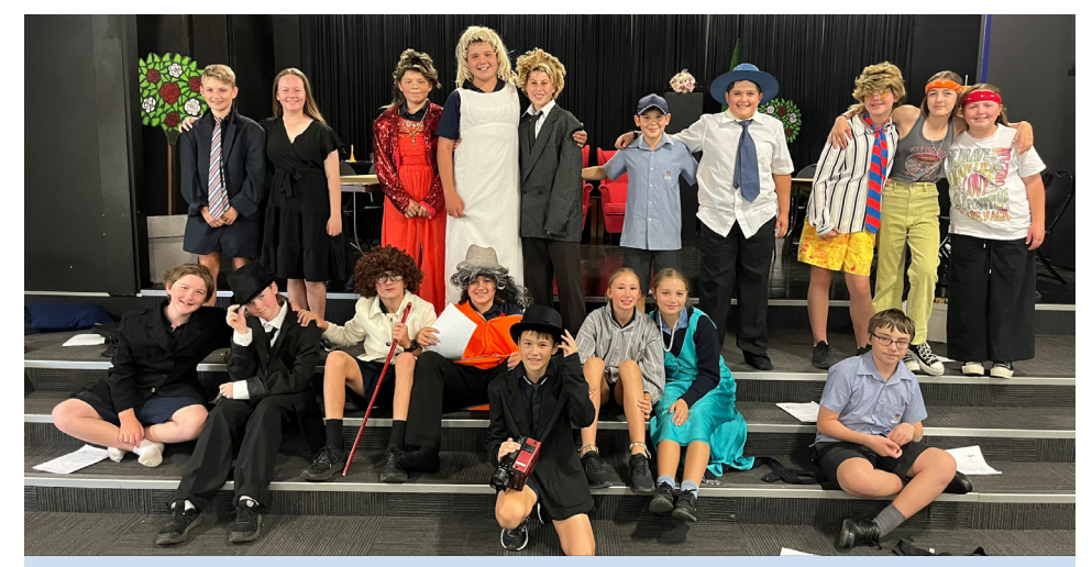
PERFORMING ARTS > Year 7s dressed up and took to the stage for their first performance 'Happily Ever Laughter'