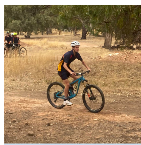
OUTDOOR EDUCATION > Year 11 students took to the tracks at Melrose for mountain-biking this term