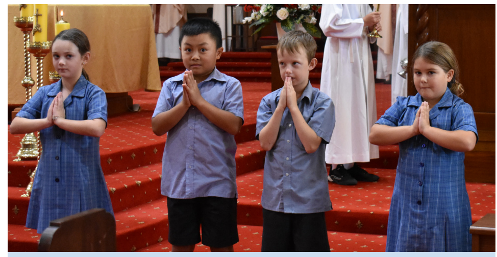
Year 3 students performed a liturgical dance during the Gospel Procession at the Chrism Mass which is celebrated in collaboration with the Diocesan Assembly