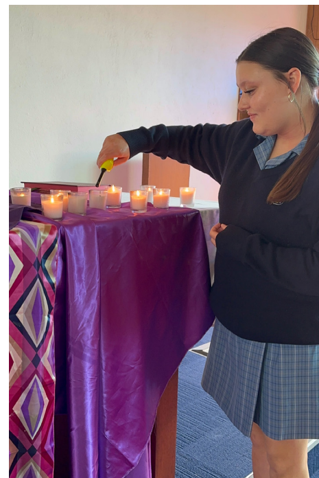
WOMEN'S DAY > Sky lighting a candle on International Women's Day