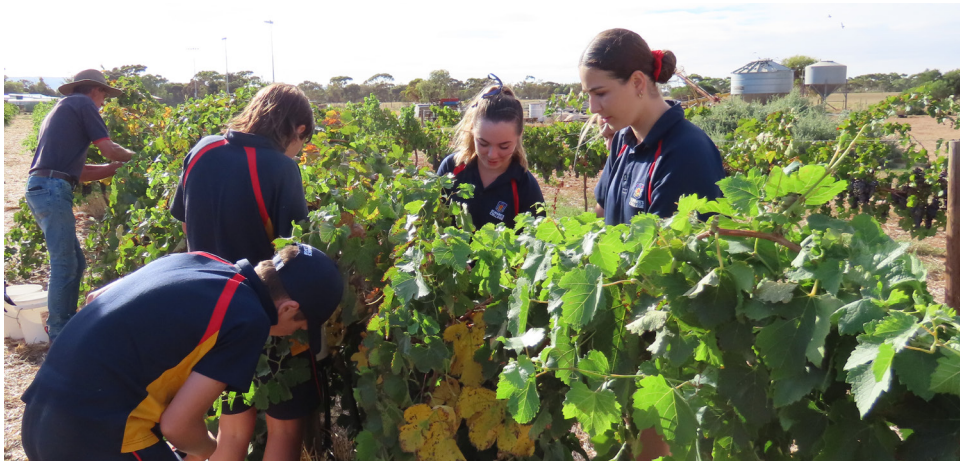
AGRICULTURE > Year 9 students picked grapes as part of the harvest process at McNally Farm. Across all year levels Agriculture students have picked, weighed, de-stemmed and crushed grapes ready to start fermentation.