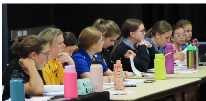
MUSICAL > Rehearsals are underway for 'School of Rock'