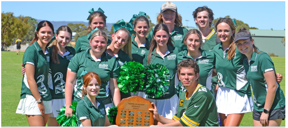
Our Gallagher Year 12s with the winners shield on Sports Day