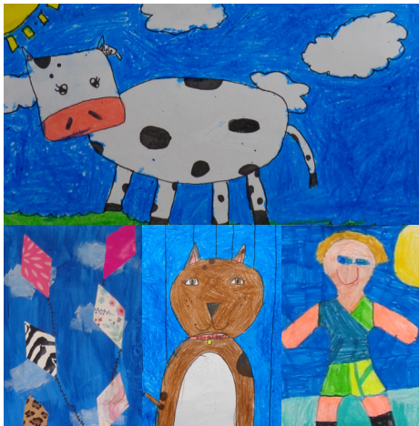
ART > Students in 3R have been creating a range of colourful art pieces which are on display in Valdocco