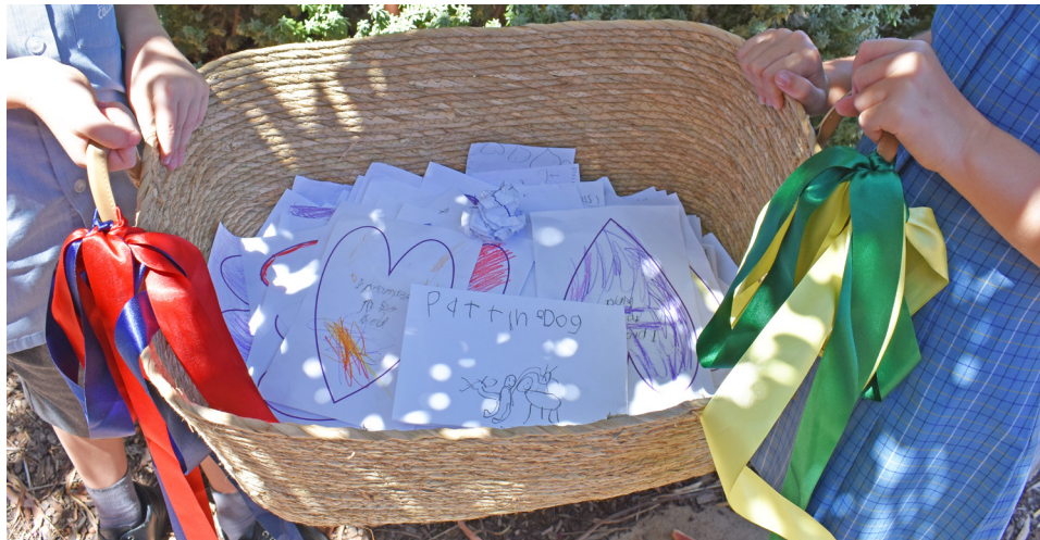
SHROVE TUESDAY > A basket of promises collected on Shrove Tuesday