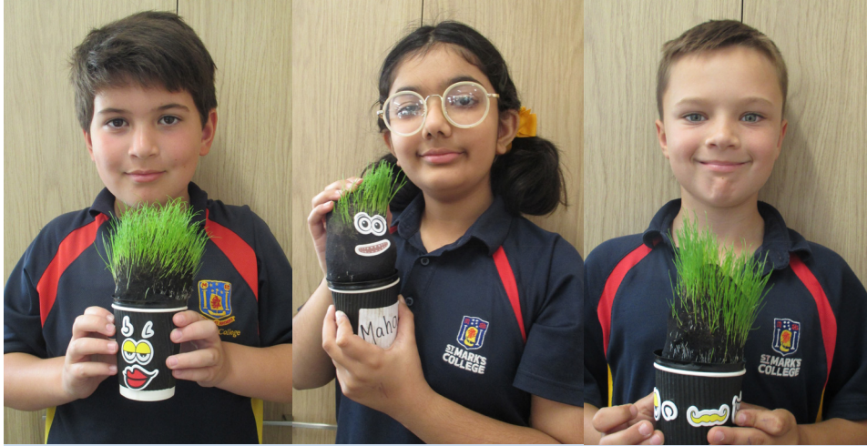
SCIENCE > 4B have been studying ecosystems in science and have grown their own 'hairy head' plants