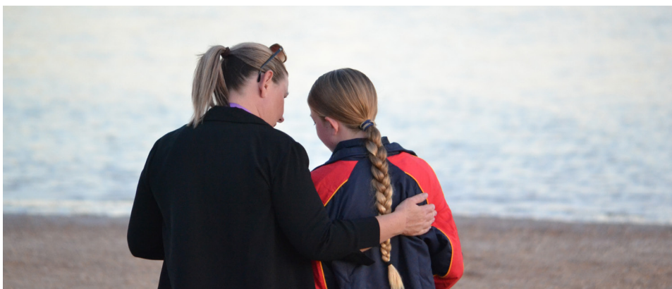
Year 9 families gathered at Solomontown Beach to mark the launch of the Rite Journey