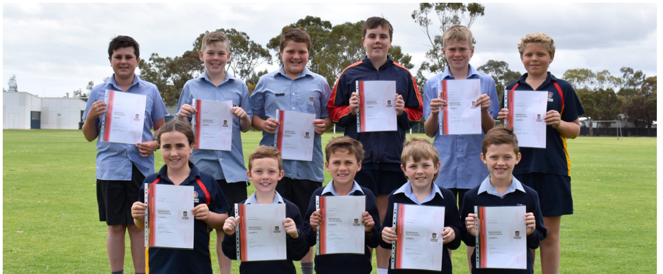
Students who competed in 3 sports for the College