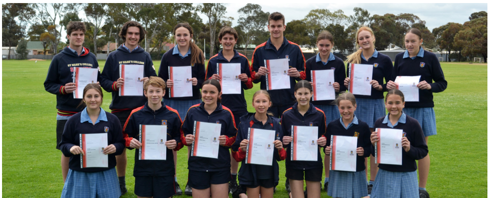
Students who competed in a sport at a State and National level