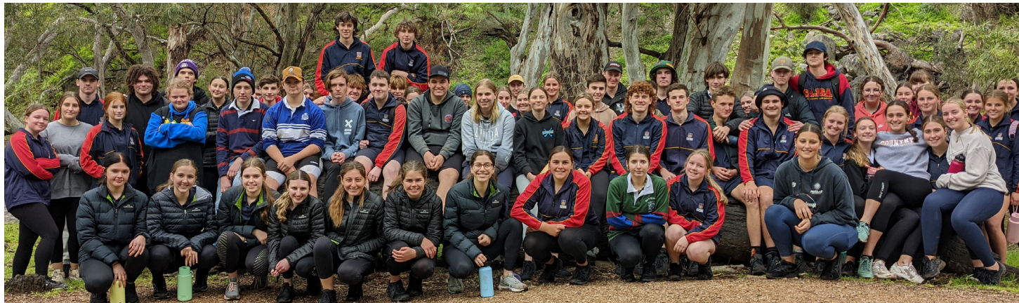
Year 11 students enjoying their Retreat

This prayer I have included below illustrates the barriers that may still exist for migrants and refugees, but more importantly demonstrates the thoughts and actions that can eliminate such barriers and extinguish any fear.