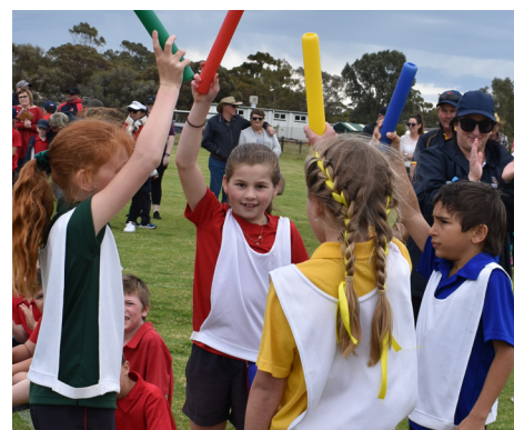
Year 3 Captains finish the baton relay