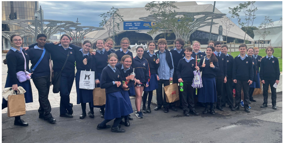
DRAMA > Drama students visited the Festival Theatre for the performance of 'Sunshine Super Girl', the Evonne Goolagong story