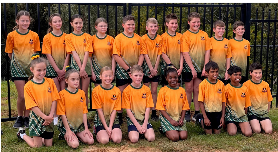
SAPSASA > Congratulations to our students who competed in the SAPSASA Athletics recently