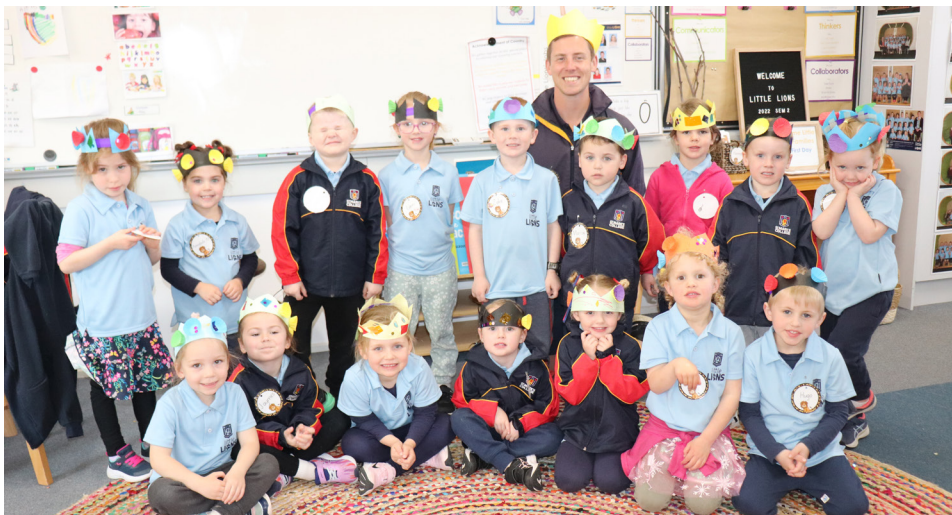
LITTLE LIONS > Our Little Lions made their own colourful crown in memory of Queen Elizabeth