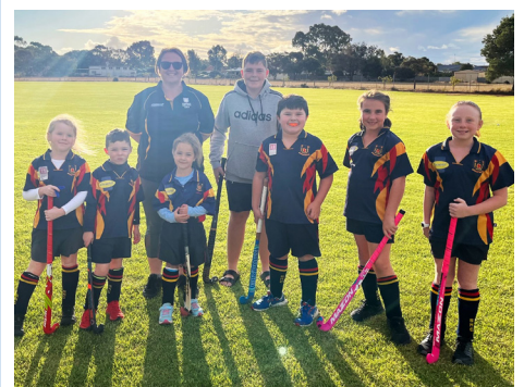
Our U10s ready to take to the field