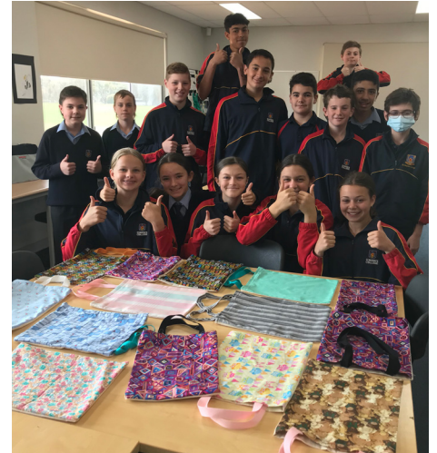
TEXTILES > Year 7 students created their own unique and colourful tote bag