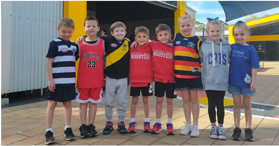
TEAM COLOURS DAY > Our Receptions were excited to support their sporting teams on Team Colours Day