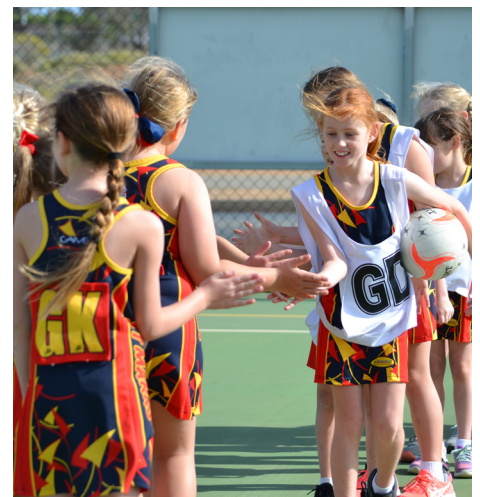
U9s congratulating one another after the game