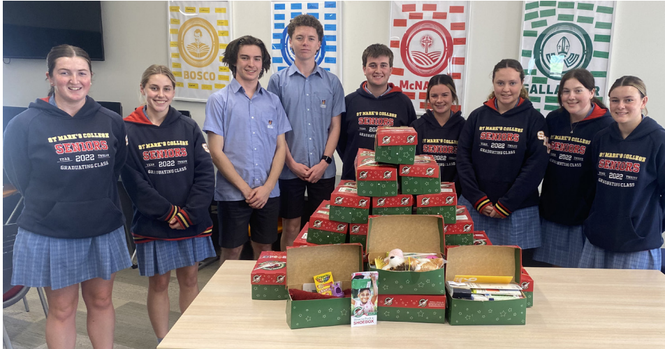
COMMUNITY > Our Year 12 leaders with the Christmas Shoeboxes donated to Operation Christmas Child