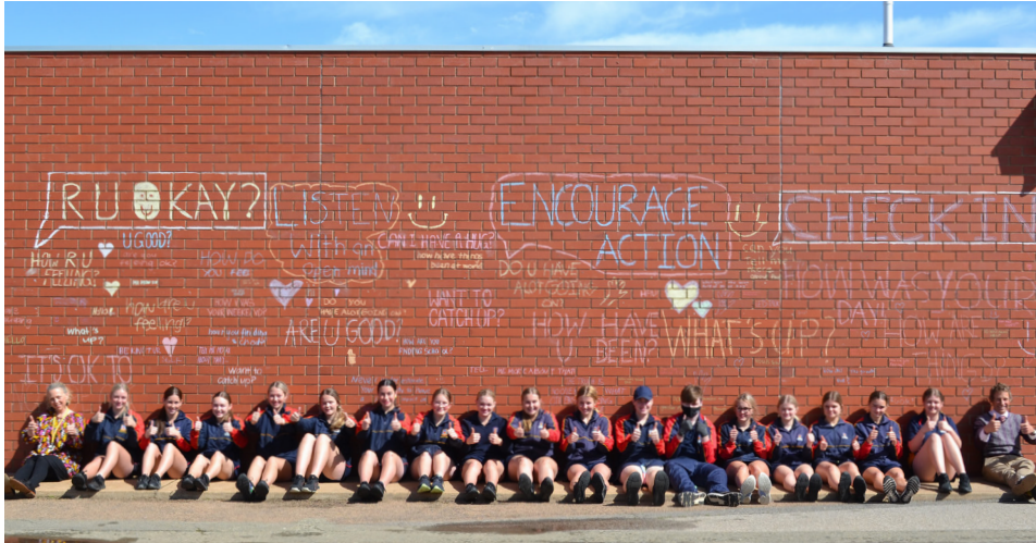
RU OK? DAY > Across the campus students participated in a range of inclusion and wellbeing activities, including this vibrant Message Mural