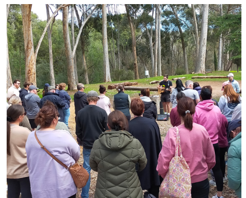
Staff pause for Liturgy at Bundaleer Forest