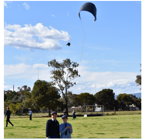
SCIENCE > Lexie, Della and their classmates in 4 Blue made kites as part of their learning into Force and Flight