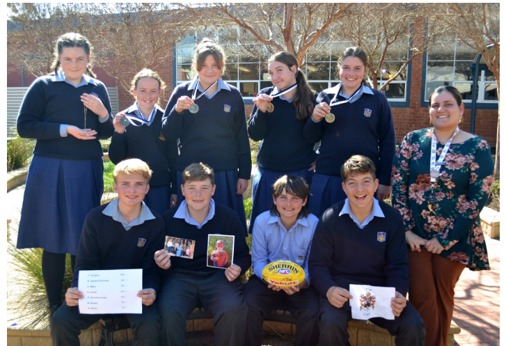
GLOBAL STUDIES > Year 8 students brought something to show and share with their class, giving a sense of pride in their heritage