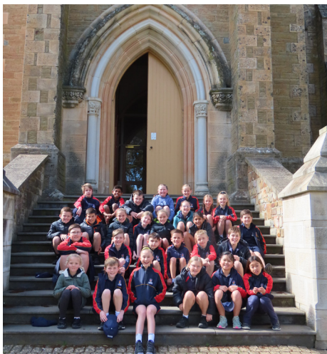
EXCURSION > 4 Red visiting St Aloysius Church at Sevenhill