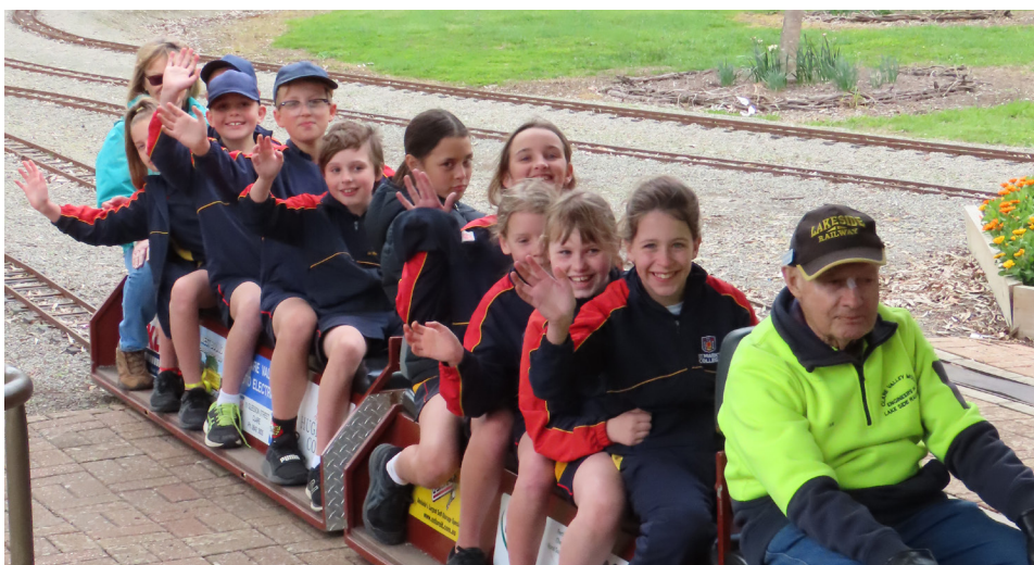
EXCURSION > Year 4s enjoying a ride on the miniature train in Clare