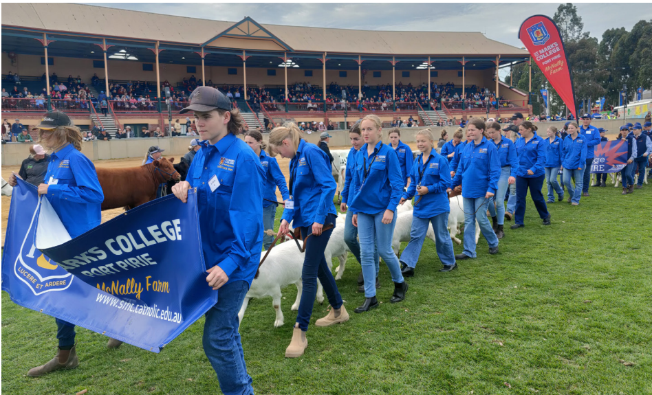
Leading the goats in the Grand Parade