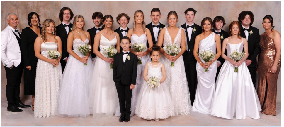
We congratulate our Debutantes and their partners in the Blessing of the Fleet