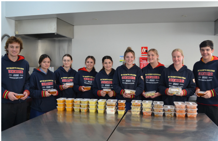
FOOD + HOSPITALITY > Year 12 students have prepared, cooked and packaged a range of delicious meals to donate to Tasty Tucker, and initiative offered through Uniting Country SA's Community Centre