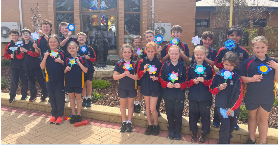
RELIGIOUS EDUCATION > Our Year 3s celebrated the Nativity of Mary (the celebration of Mary's birth) making flowers with special birthday messages