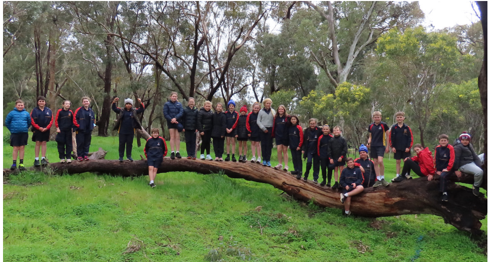
EXCURSION > Year 5 students enjoying their excursion to Melrose