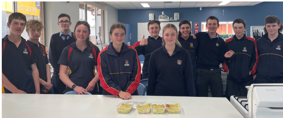
Our Year 10 RE classes have started cooking meals for Fred's Van

You may recall the Gospel reading of the Mustard Seed that I shared in the last newsletter. I asked if you could suggest what the twist may be in this tale?