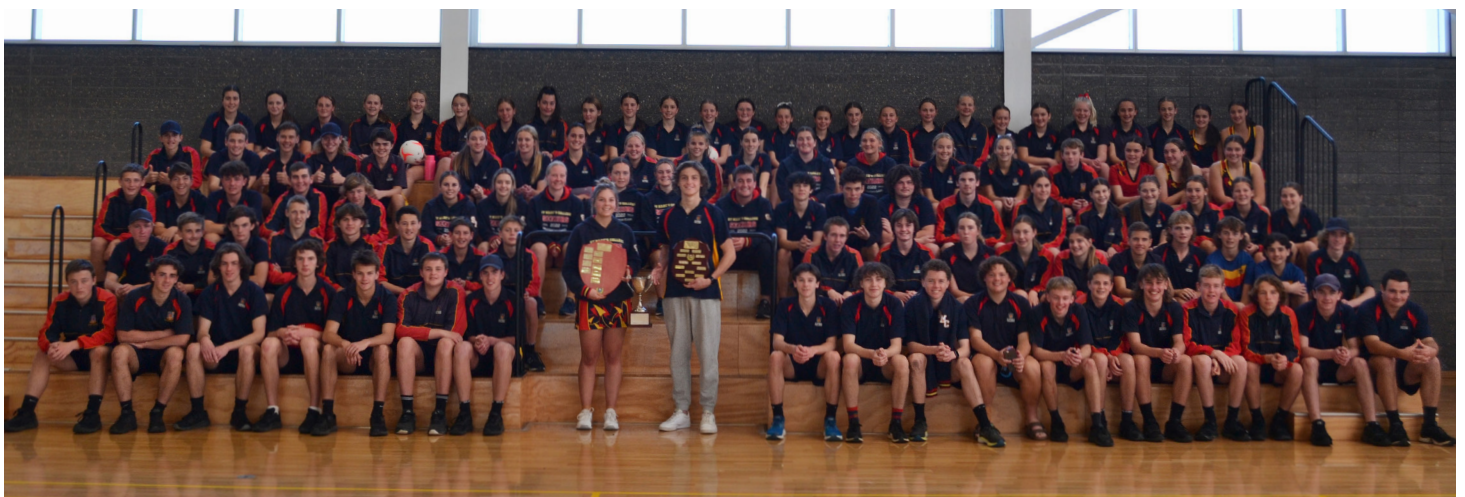
FR DENNIS HANDLEY CUP > Congratulations to our students who took out the win in the Fr Dennis Handley Cup competition