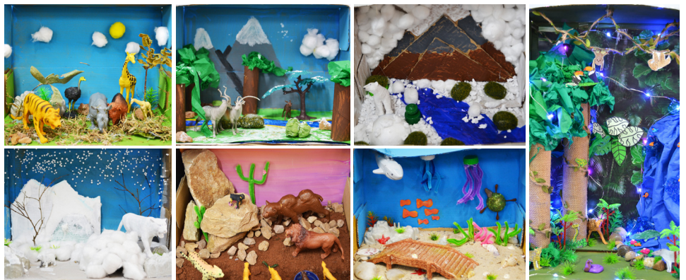
HASS > Year 9 students have been exploring the various biomes found within our world. Working in groups, students gathered resources to create dioramas that showed what these environments typically look like. Accompanying their diorama, students also made posters that contained information about the various characteristics of their biome, including temperature, precipitation and food webs.