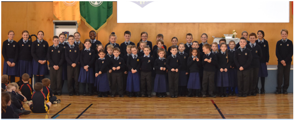
Our Semester 2 SRC's were commissioned at the Leadership Liturgy