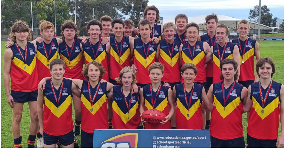
KNOCK OUT > An outstanding effort by our Year 9 and 10 boys in getting to the Statewide Division 2 Grand Final. Unfortunately the team lost to Grant High School on the day.