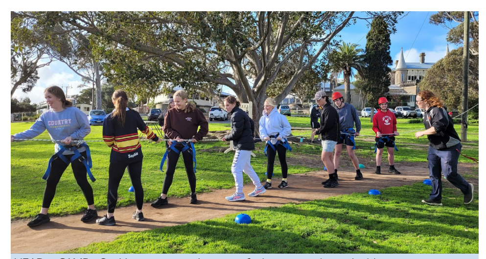
YEAR 10 CAMP > Our Year 10s enjoyed a range of adventure and team building activities on camp this week in Victor Harbor