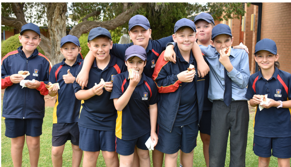
Celebrating the Feast of Our Lady, Help of Christians with a sausage in bread