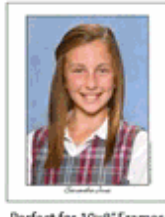
Perfect for 10x8" Frames