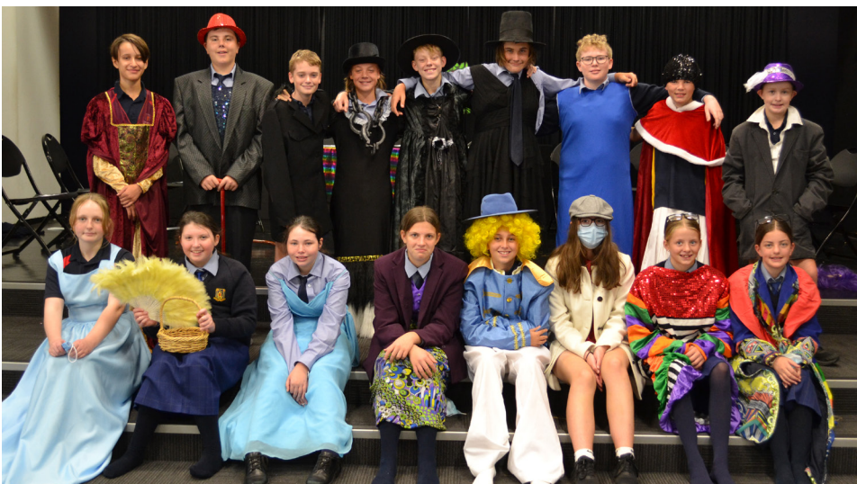
DRAMA > Year 7 students have taken to the stage performing 'Happily Ever Laughter'