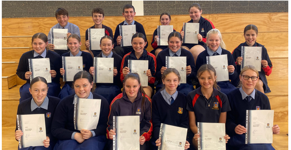
AWARDS > Across Bosco Campus, Outstanding Endeavour was celebrated with awards given across all year levels. Photographed are our Year 8s who were recognised