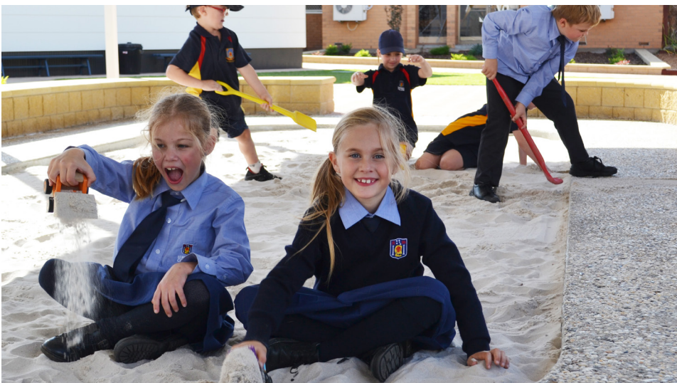
DEVELOPMENTS > Our Year 2s tested out the new sandpit next to the Valdocco Centre