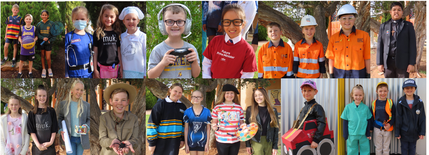
Students enjoyed dressing up for Benedict's first Careers Day