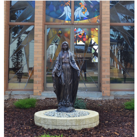
A statue of Our Lady now features in the garden behind the Benedict Chapel