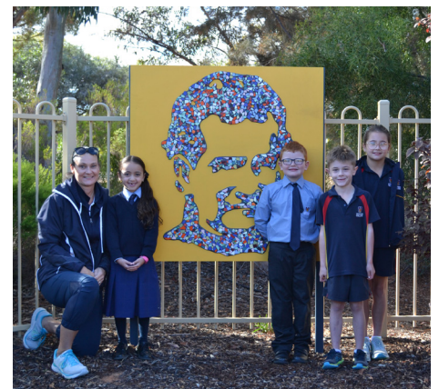
Our 2021 SRC students created a beautiful mosaic of Don Bosco which features at the entrance of Benedict Campus