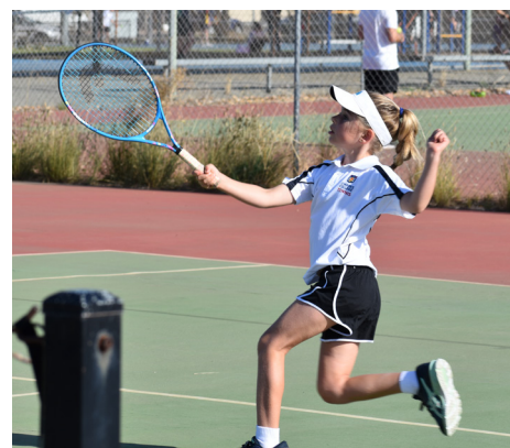
Indiana takes a shot