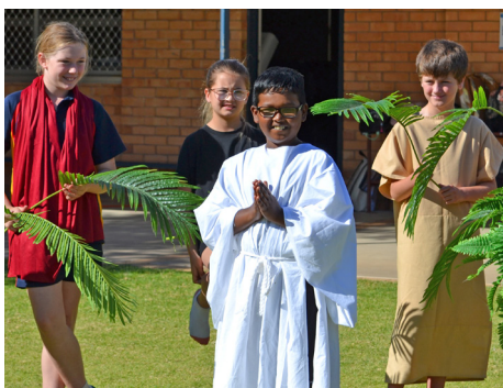
Jesus (Shoalin) is welcomed with palms on Palm Sunday