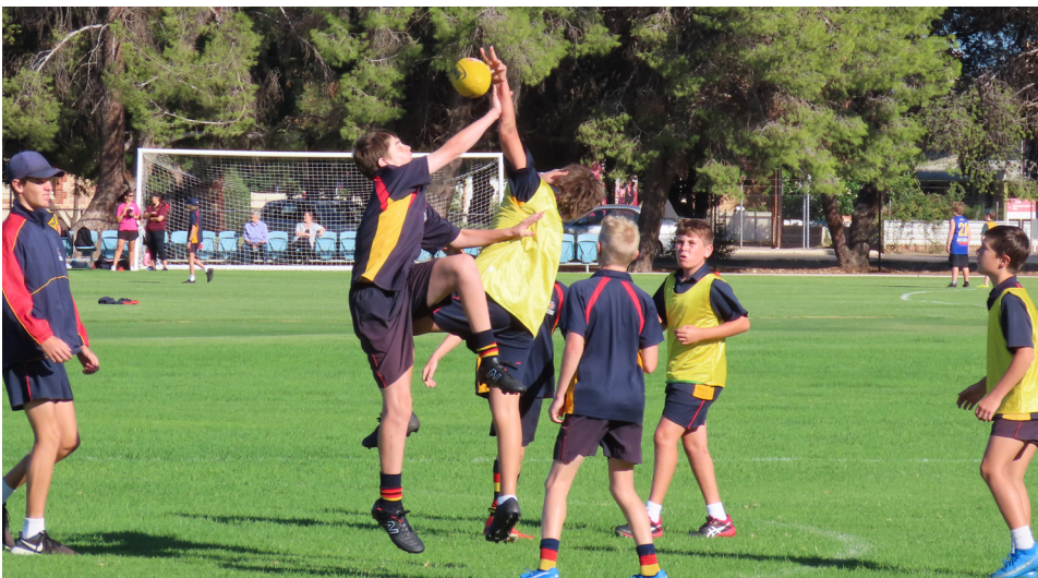
Competing at the Winter Carnival for Year 5 and 6 students in the region