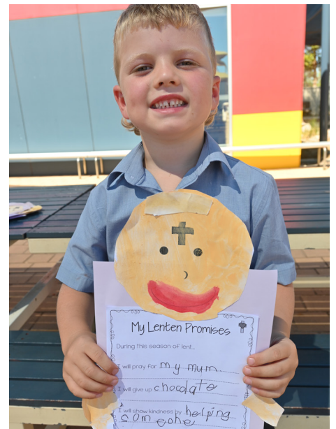
Fraiser's lenten promise "I will show kindness by helping someone."