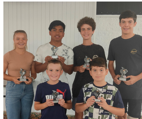
Our Most Consistent Players at the St Mark's College Tennis presentation