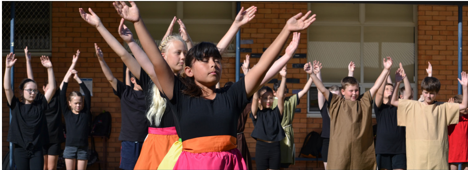
Year 5s celebrating the resurrection at the Easter Reenactment