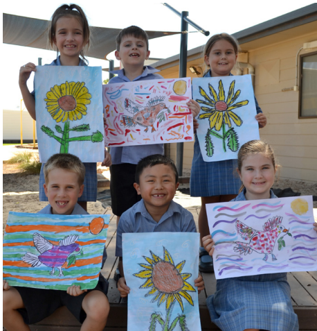
PRAYERS > With thoughtful creativity, our Year 2s painted peace doves and bright sunflowers, the national flower of Ukraine