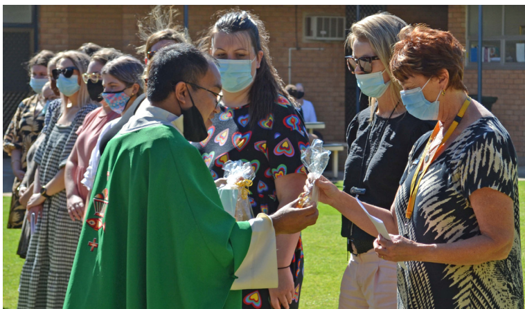
New staff to the College were officially commissioned