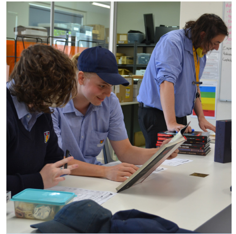
LUNCH > Tabletop games have commenced on Tuesday's at lunchtime