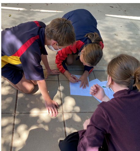
RELIGION > Year 7 students participated in team building activities with the NET Team