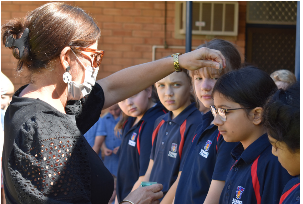
Ashes were sprinkled as students paused to commemorate Ash Wednesday