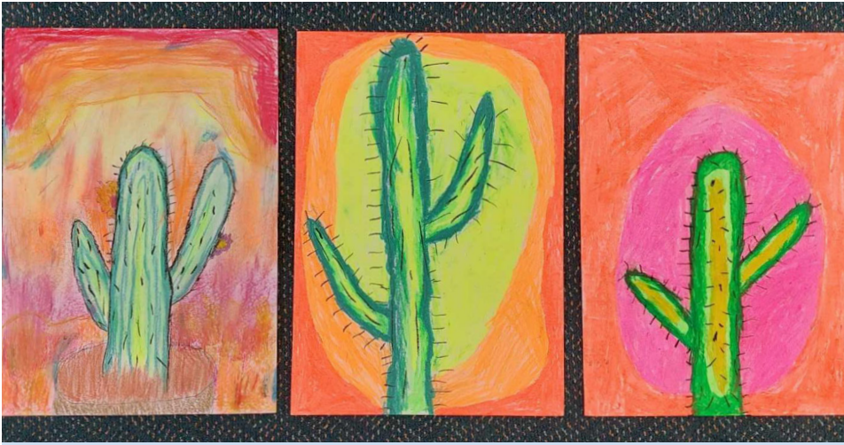
YEAR 5 > To accompany their learning about science, Year 5s created these stunning oil pastel pieces of cacti