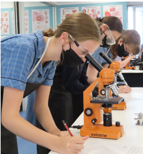
BIOLOGY > Year 11 students were studying cells using microscopes in Biology