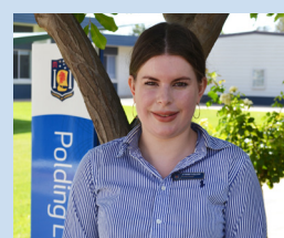
EMMA STONE Bosco English + RE