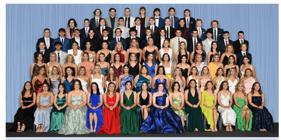
Our Year 12 graduating Class of 2021

The year closes with some extraordinary ceremony and acknowledges some remarkable people.