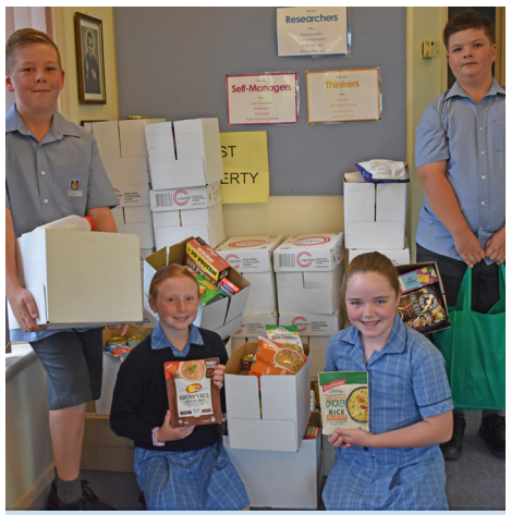
DONATION > Thank you to our Benedict community who donated goods to support the Vinnies Christmas appeal