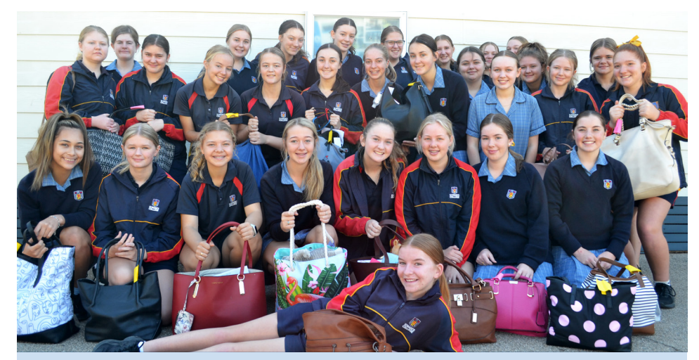
RITE JOURNEY > Congratulations to our Year 9 Rite Journey students who have supported Share the Dignity creating over 60 bags to assist local women in need