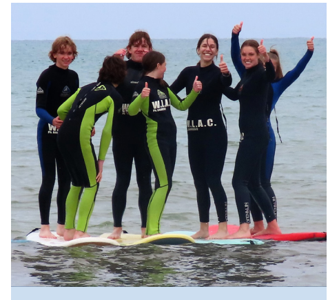
Balancing on the boards