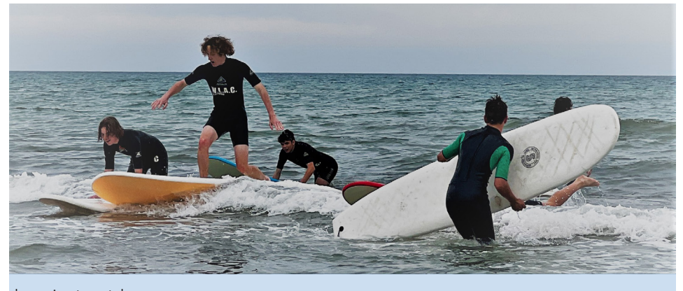
Learning to catch a wave