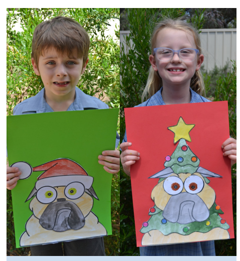
YEAR 1 > Our Year 1s have created Christmas Pig the Pugs