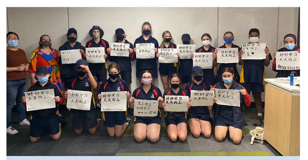
CHINESE > Year 8 students went on an excursion to Adelaide Confucius Institute and Chinatown and enjoyed a range of cultural experiences