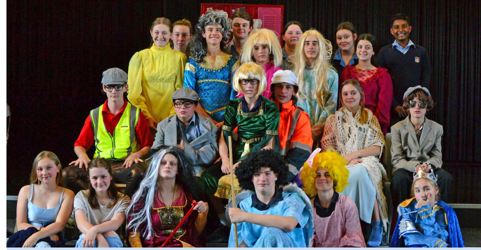
CREATIVE ARTS > Year 8 Drama students recently performed "Cinderella"