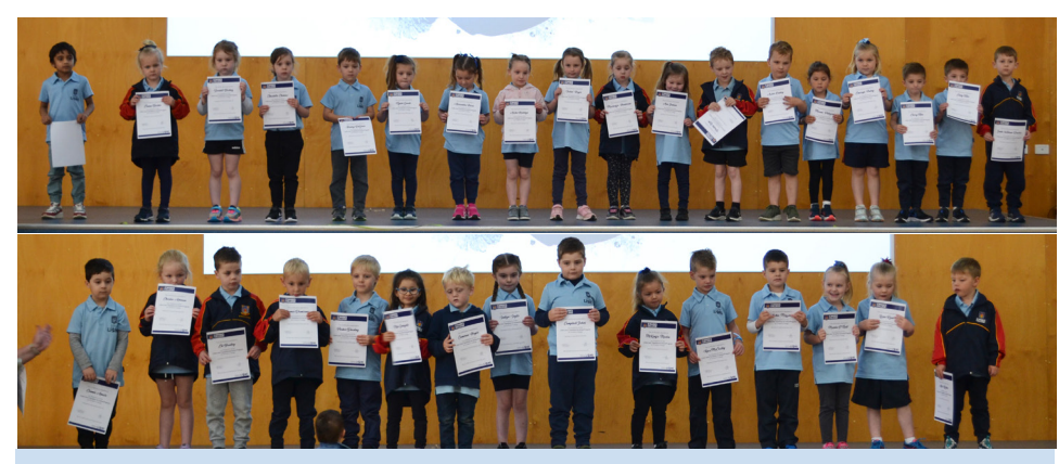
Our morning and afternoon Little Lions groups with their certificates

Congratulations to our Little Lions who celebrated the completion of their program and enjoyed their orientation days! We can't wait to see you at school next year.