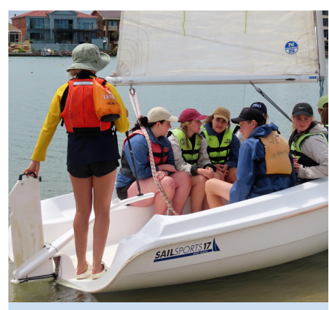
Off for a sail