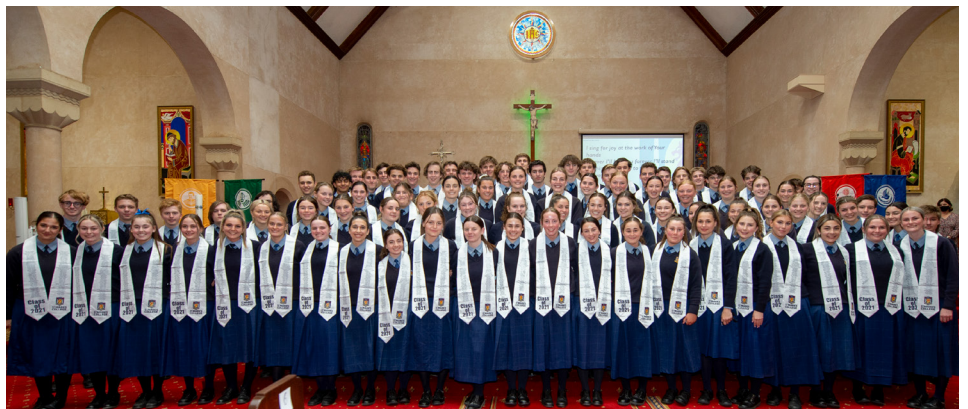
Our Class of 2021 at the Thanksgiving Mass