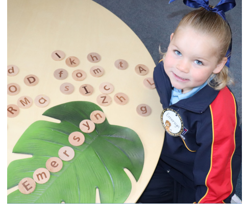
Emersyn makes her name using wooden letters