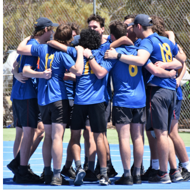
A team huddle before competing in the annual Year 12 boys soccer match

Our Class of 2021 has been officially farewelled from the College in a week of celebrations!