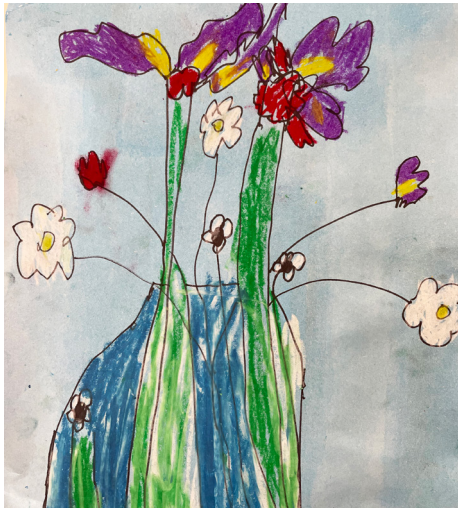
ART > Elsie's drawing of a vase full of spring flowers