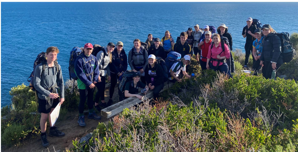
OUTDOORED > Year 11 students adventured through Deep Creek Conservation Park on a 3-day camping expedition