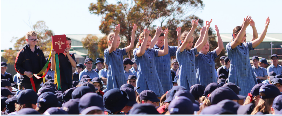
Year 5 and 6 student bring forward the Gospel

We have begun our final term at full speed. Many beautiful moments have happened in these two weeks as well as lots of learning.