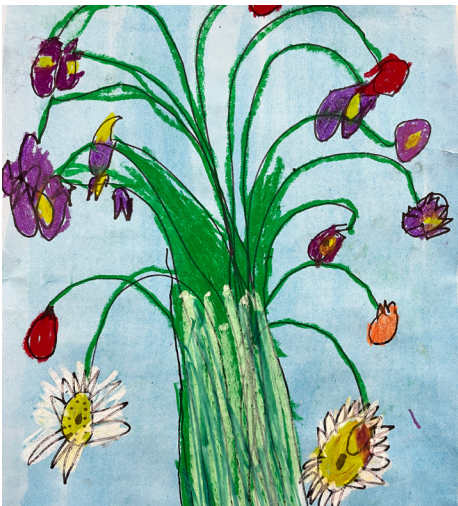
ART > Flynn's drawing of a vase full of spring flowers