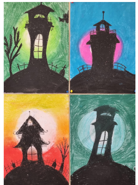
ART > Our Year 6s created some spooky artworks using soft pastels or chalk pastels to create and blend the background and black oil pastels for the silhouette