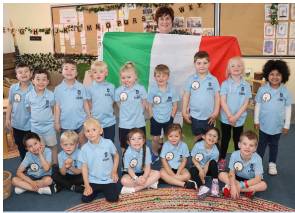
Little Lions take a first taste of learning Italian