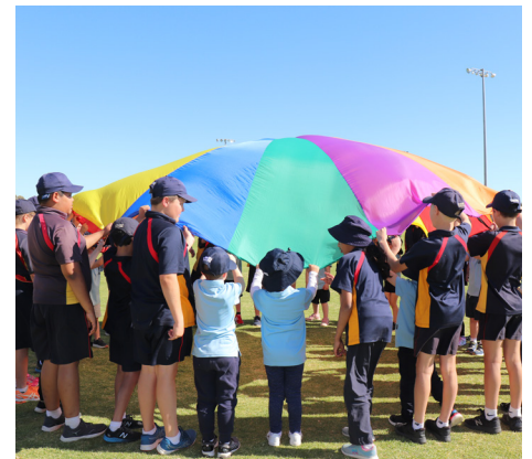
Parachute fun with Year 5 Buddies