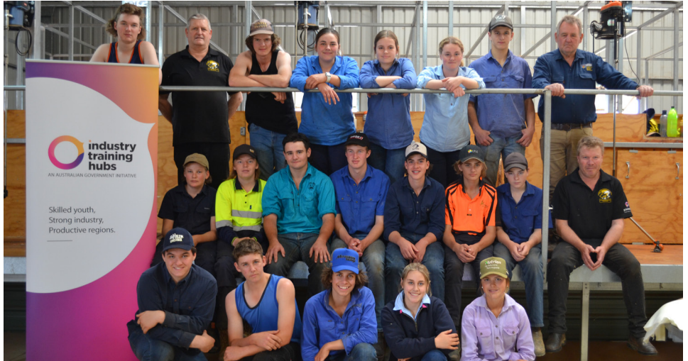
AGRICULTURE > Students participated in week long shearing course at McNally Farm, supported by the Industry Training Hubs