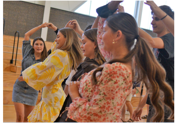
Dance practice ready for Graduation