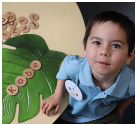
Kobe makes his name using wooden letters