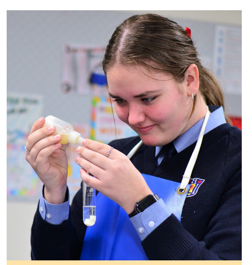
Madison during the sheep pluck investigation in science