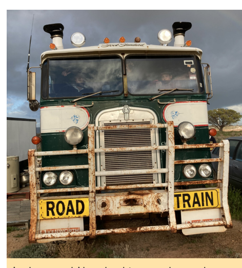
Anthony and Alan checking out the truck at the 'Stories from the Road Museum'