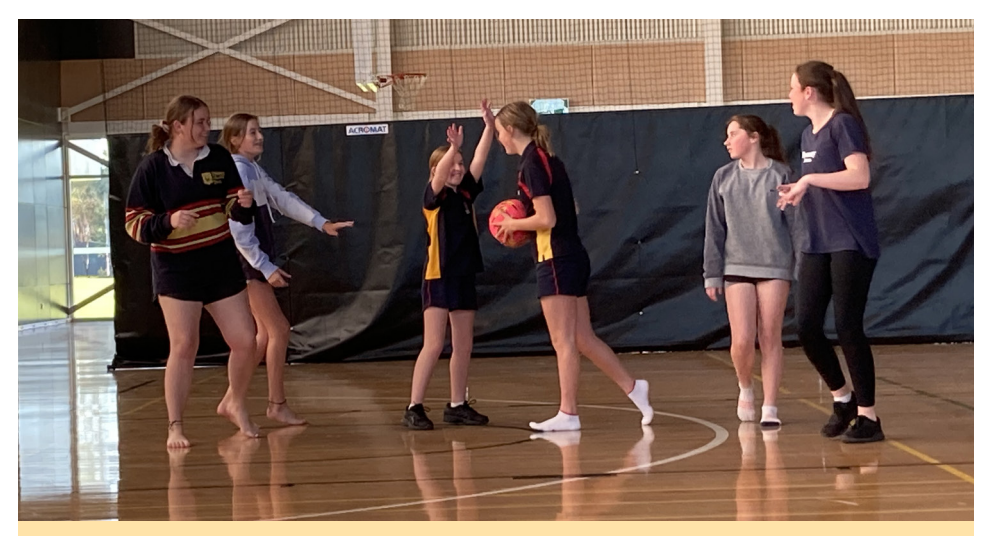
Enjoying a game of netball in the Sports Centre