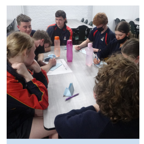
Group work at Year 11 Retreat