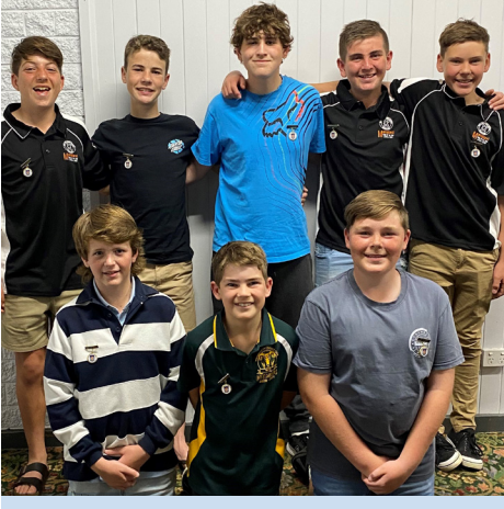
Life Members of the St Mark's Football Club