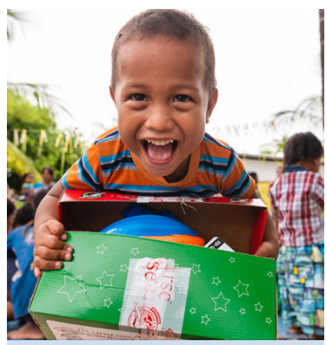
Children are excited to receive a shoebox through Operation Christmas Child

SOUTHERN CROSS: Click here for the latest edition.