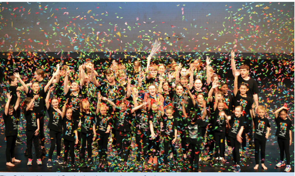
The College Musical finished with an explosion of colour on stage

We enjoyed the musical. There were moments 'Grand' and exams challenging. We ask 'How are ya' and the Italian heritage lives on.