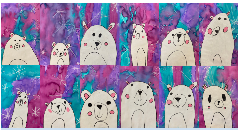
ART > Reception Gold created these cute polar bear art pieces as part of their learning about fiction and non-fiction books