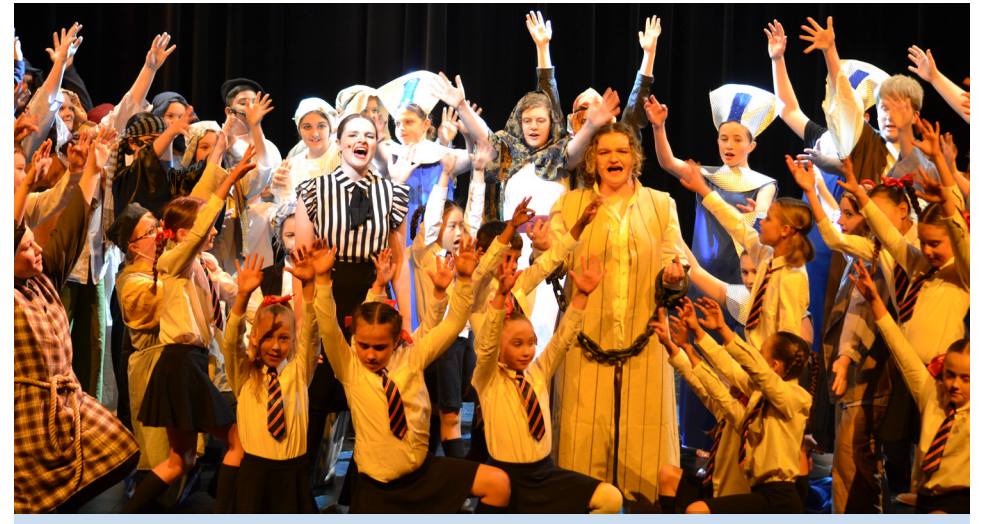
The cast performing 'Song of the King'