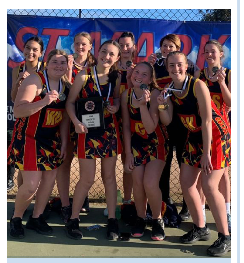
F Grade Premiers