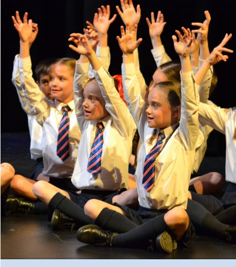
Our Year 3s performing