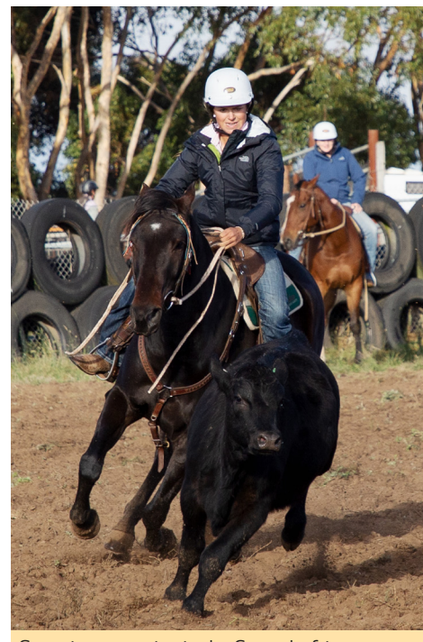
Georgia competing in the Campdrafting competition