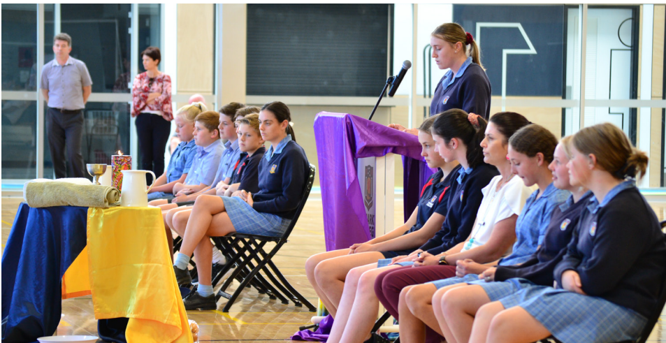
LITURGY > Bosco students gathered to reflect at today's Holy Thursday Liturgy.