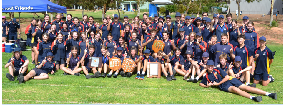
Celebrating a win at the Spencer Gulf Athletics Carnival

Last Friday, seventy-two students from Years 8-12 travelled to Caritas College in Port Augusta for the 42nd annual Spencer Gulf Athletics Carnival. Although the weather on the day was wet, windy and sometimes unfavourable, our students rallied together and showed immense resilience and enthusiasm in each individual event they participated in.