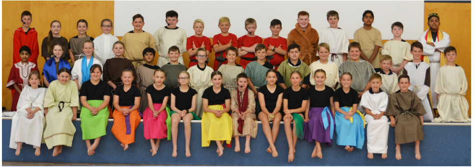
Our Year 5 students presented the Easter Reenactment