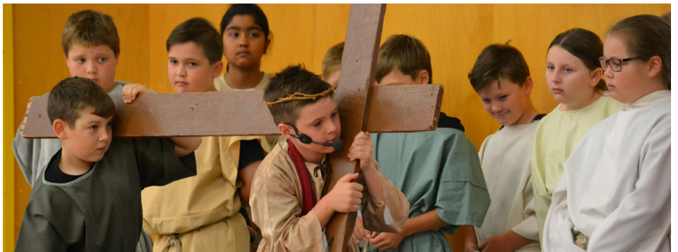
Jesus carries the cross

"I had a lot of fun doing the Easter reenactment. My part was a disciple. I understand the story a lot better now."