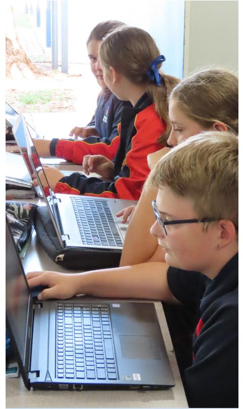
HASS > Ms Travers Year 7 HASS class have been investigating some mysterious things humans have observed, such as The Easter Island statues, Stonehenge and Mungo Man.

Students were working on becoming familiar with notetaking skills, making, saving and retrieving files and learning source analysis skills. They were developing their skills to decide if sources were reliable and what data bases they should use for their research.