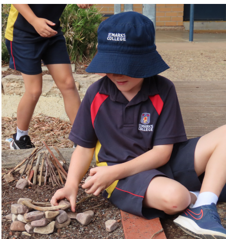
DESIGN + TECHNOLOGY > Year 3 students designed and made their own nature shelter, perfect for a Duplo figurine.