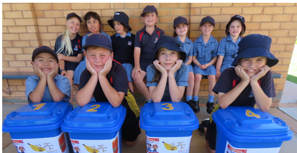
LUNCHTIME > A range of new Library activities are available from the Library at lunchtimes! Each wheelie bin is filled with activities to play in groups - the students are thoroughly enjoying them!