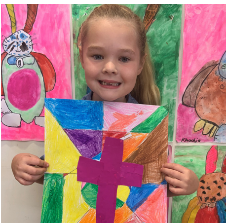
ART > 1 Red have been creating beautiful artworks, including a stained glass window Lenten Cross, like this one created by Aubrey