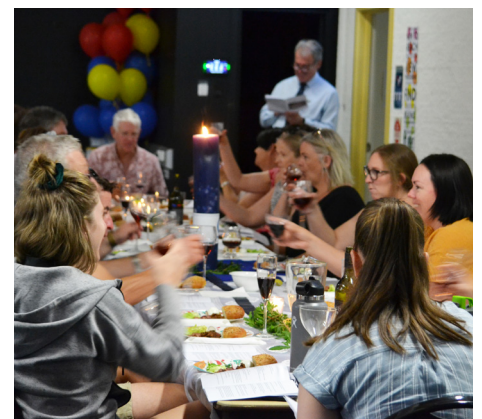
Staff celebrating The Passover