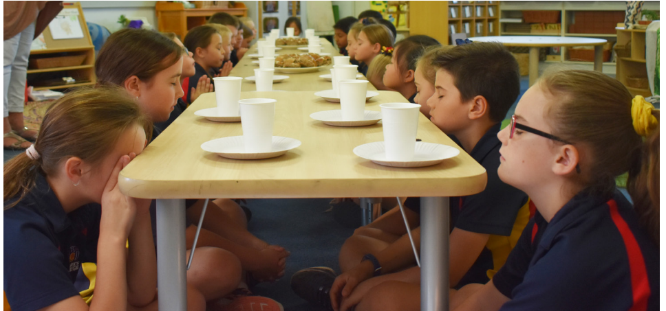
THE LAST SUPPER > 3 Blue taking a moment to pray before they shared 'bread and wine' in a reenactment of the Last Supper