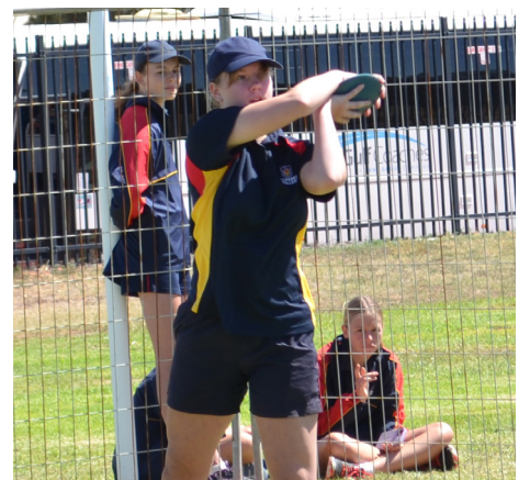
Capri throws the discus