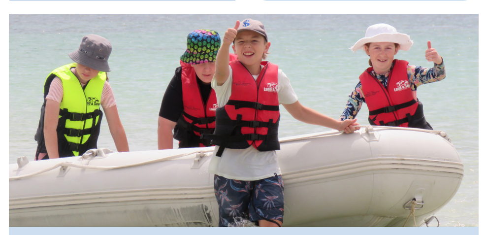
Angas and Whitney give Year 7 Camp a big thumbs up

"The activities at camp were really fun, especially snorkelling! We got to see so many cool things like squid, starfish and crabs." Poppy, Year 7