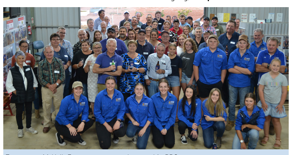
Toasting our McNally Farm supporters at the annual Ag BBQ