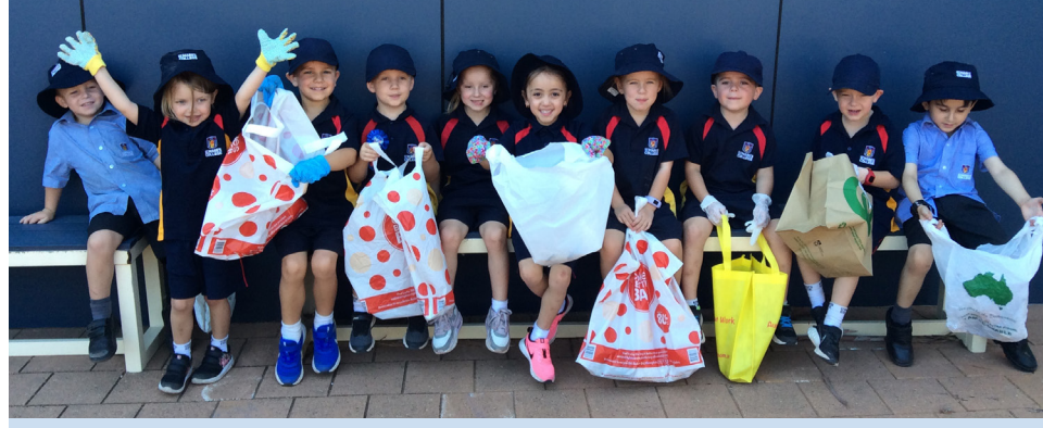
CLEAN UP AUSTRALIA DAY> Reception Green helping to clean up Benedict