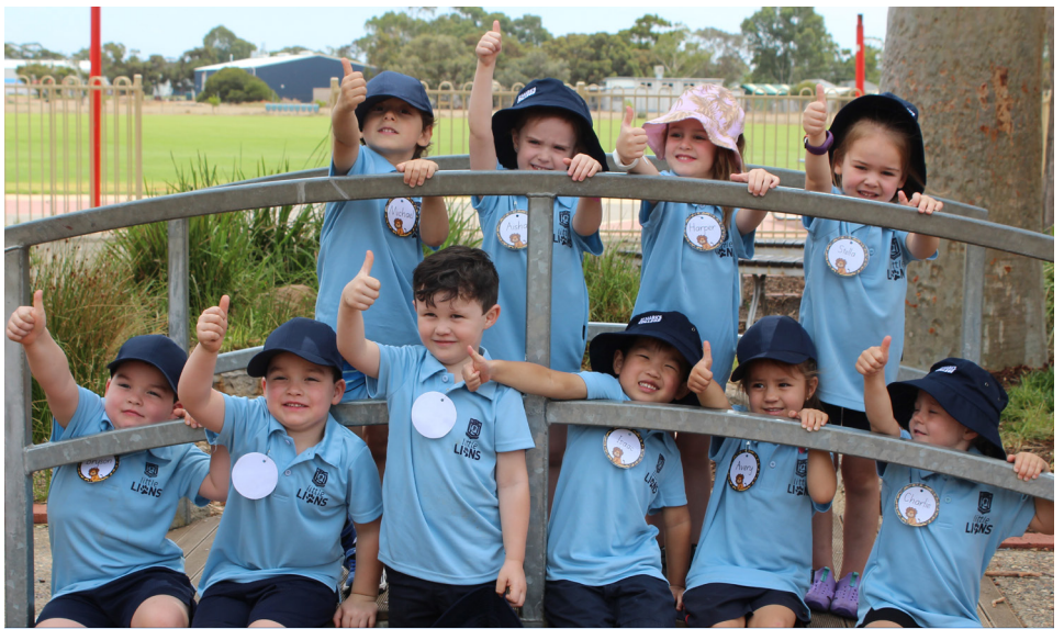
Thumbs up from our new Little Lions