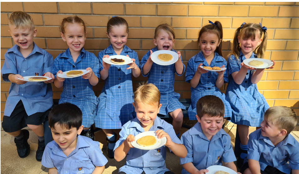
Reception Green enjoying pancakes on Shrove Tuesday