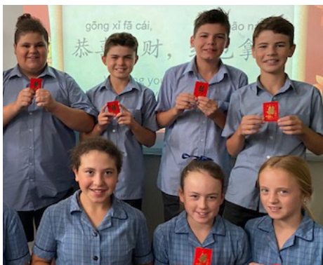
YEAR 7 > Students learnt about the Year of the Ox during their Chinese lessons. Traditionally, at Lunar New Year, younger people are given 'Hongbao' or Red Envelopes with money inside to ensure a prosperous year ahead.