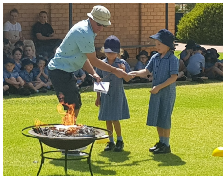
Pledges were brought forward to create the ashes

During Lent classes across the school will reflect on and discuss the stories of Project Compassion and support this program through Fundraising. Various initiatives will run across the College through the remainder of the term. Details will be communicated by class teachers and student organising groups. If you would like to follow the stories at home click here .