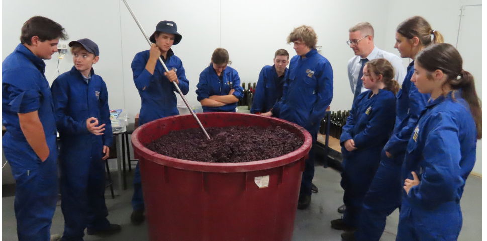
GRAPE HARVEST > Year 10 students crushing grapes as part of the preparation of our 2021 Shiraz wine vintage.