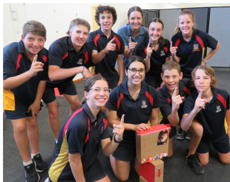
Mc Nally House Reps discuss leadership qualities at the Student Leaders' Day