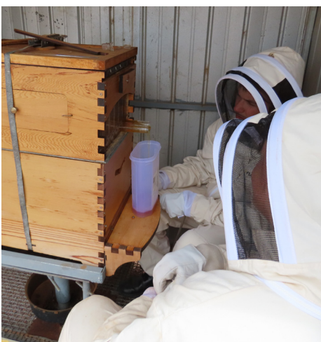
HONEY > Year 11s collecting honey, fresh from the hive