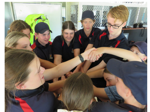
Learning team skills through problem solving at the Student Leaders' Day