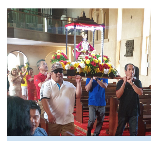
Santo Nino celebrations at the Cathedral