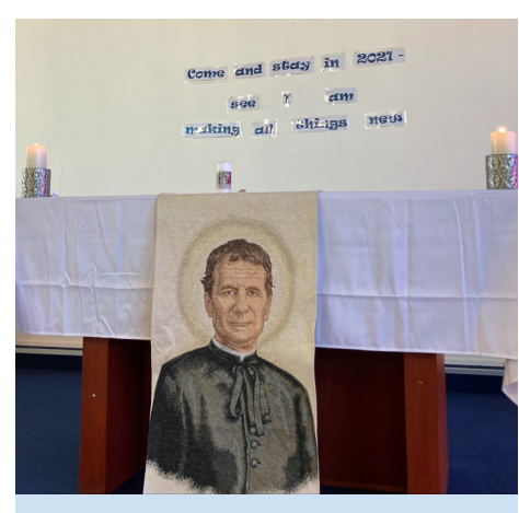
'Come and Stay' message at the Boarders welcome liturgy