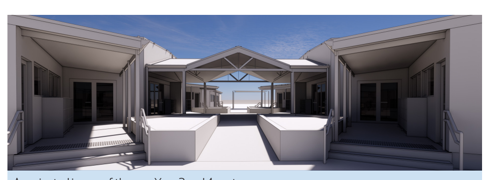
A projected image of the new Year 3 and 4 centre