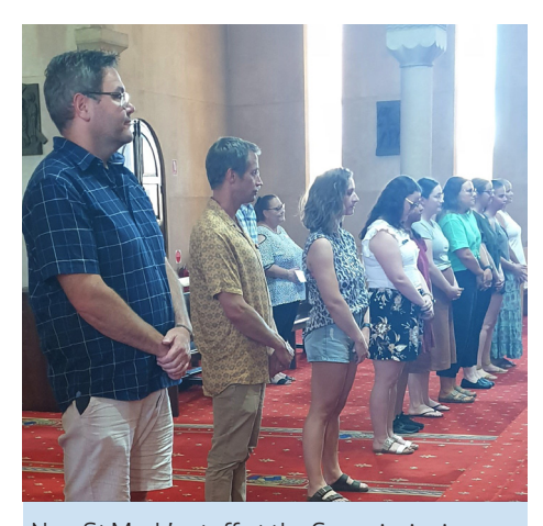
New St Mark's staff at the Commissioning Mass