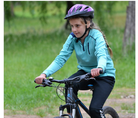
Kloe mountain bike riding

"I really liked camp it was an opportunity to get to know other people that you wouldn't normally talk to.