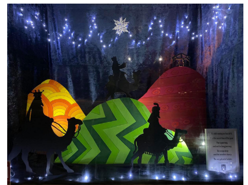
Our Christmas Window lit up at night

I had the opportunity to stand with our school community on 11 November. We stood in silence with a catafalque and flag. We stood for the Last Post and the Ode. We stood to remember that this country creates courageous people who stand against tyranny. We stood in silence to mark the anniversary of the Armistice which brought an end to The Great War of 1914 - 1918. I stood with our young people for Remembrance