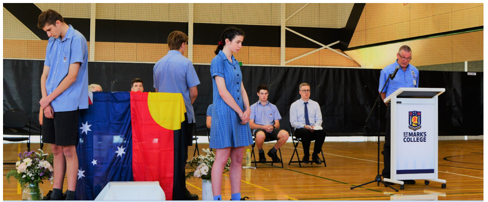
Bosco Campus pauses to reflect and remember on Remembrance Day