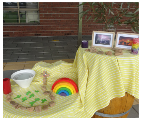
A spiritual place at Year 8 Retreat