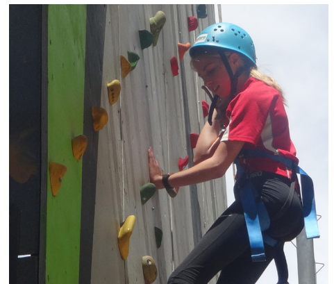
Zara rock climbing