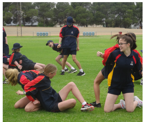
Team challenges (and laughs) on Year 8 Retreat