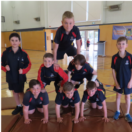
Working together to make a Year 3 pyramid!