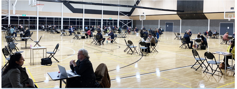
Parent Teacher interviews were held during the week with hundreds of parents attending