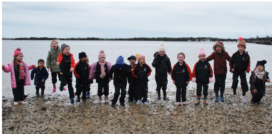
Jumping for joy at Port Broughton

Our Receptions enjoyed their excursion to Port Broughton and Redwing Farm.