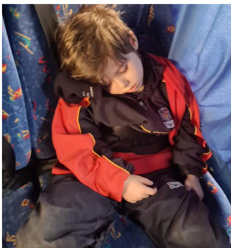
All tucked out on the way home!