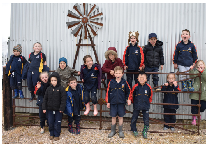
Reception Green at Redwing Farm