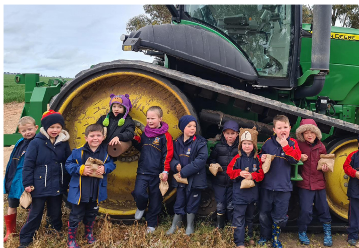
Posing at the Redwing Farm