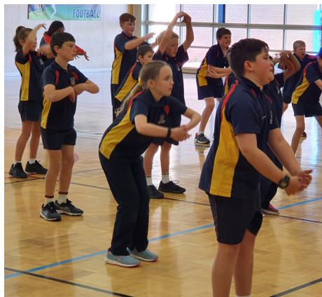
Year 4s trying some hip hop