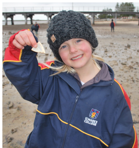
Ceci collecting shells