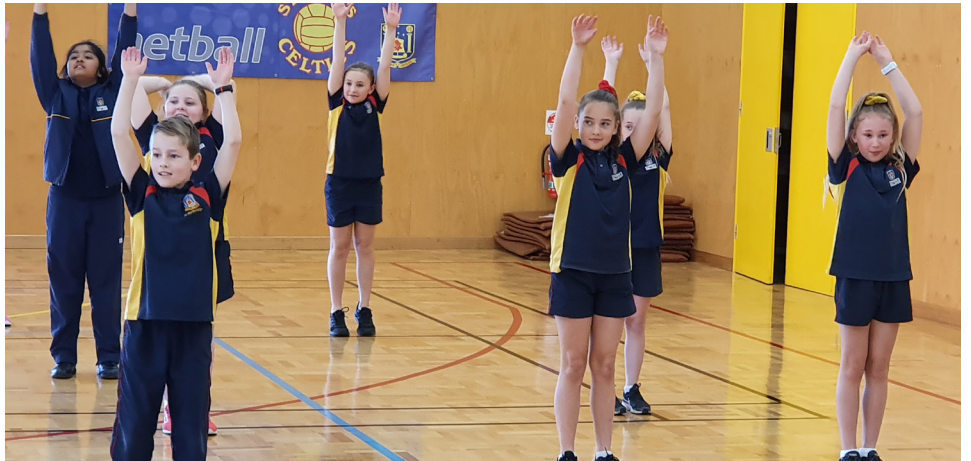
Year 4s learning new dance moves