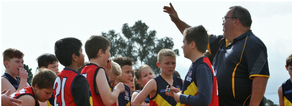
Half time huddle at the football