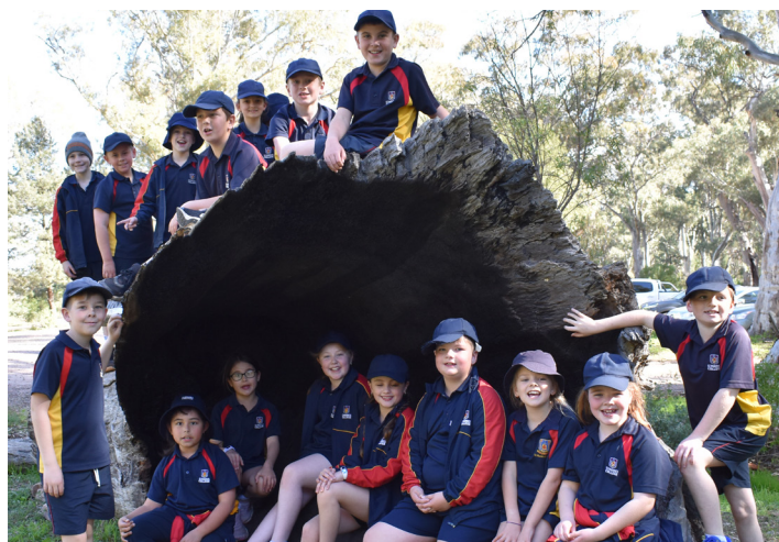
Year 3s having fun at Mambray Creek