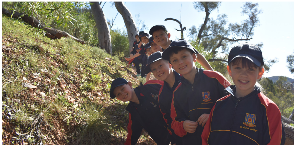
Going on a hike at Mambray Creek

Our Year 3s enjoyed their excursion to Port Germein and Mambray Creek.