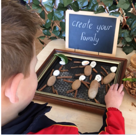
Year 1s enjoyed making nature-inspired family portraits from loose parts