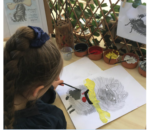
Year 1s added their own creativity to paintings of Hairy Maclary, inspired by the book series by Lynley Dodd