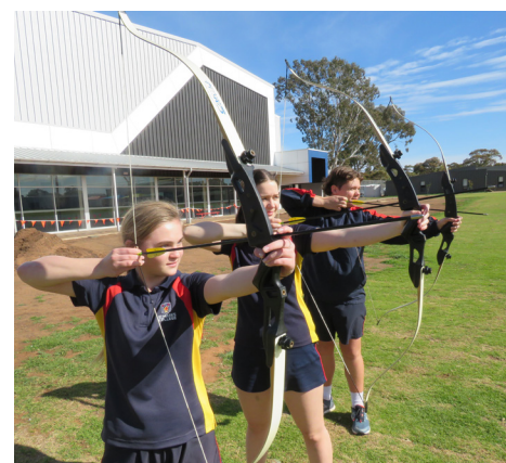
Year 10 PE students take a shot at archery