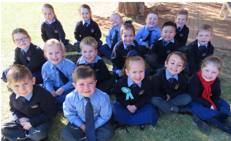
Our mid-year Receptions are setting into classroom life well