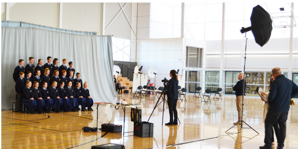
Behind the scenes action of Photo Day

I say that in every interview. This is a place of safety and it is a place of opportunity. I say that with confidence. And I say that we will see to the heart of the child. We will see the potential.