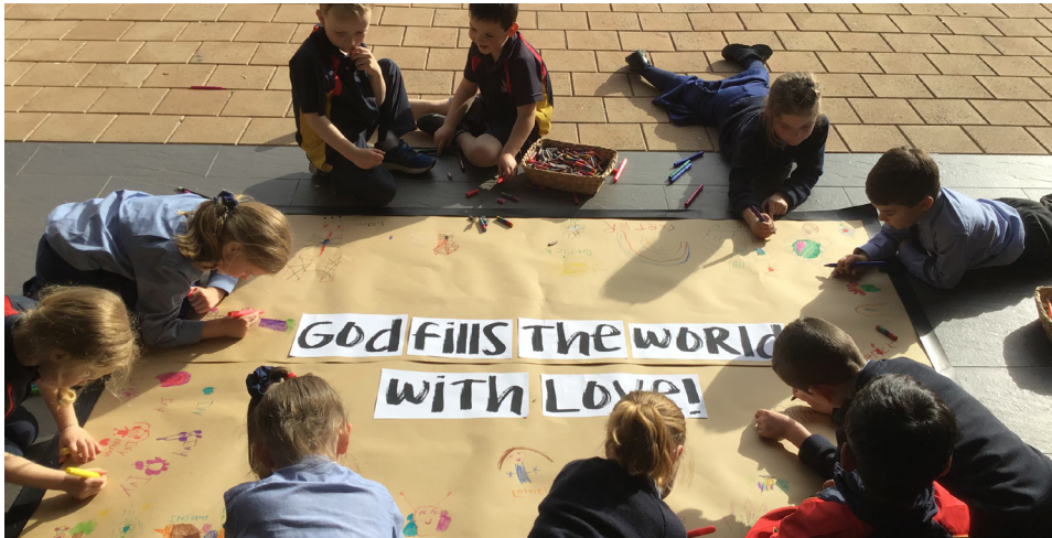
Receptions drawing how 'God fills the world with love'