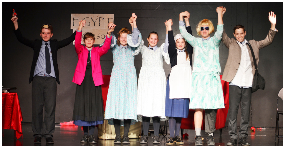
The Year 9 Drama class take a final bow