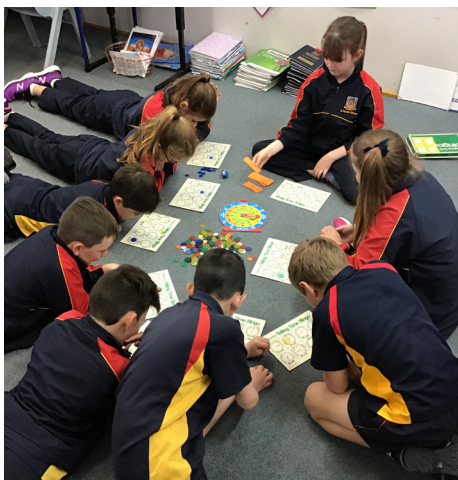
"Eye's down" for bingo