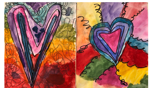
God fills the world with love- Reception Red