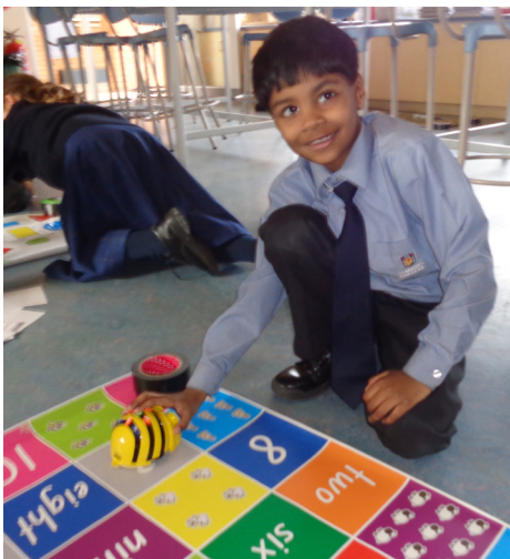
Alcuin using the Bee-Bot