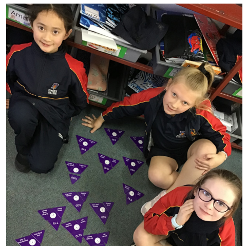
Bella, Jarva and Amahlee