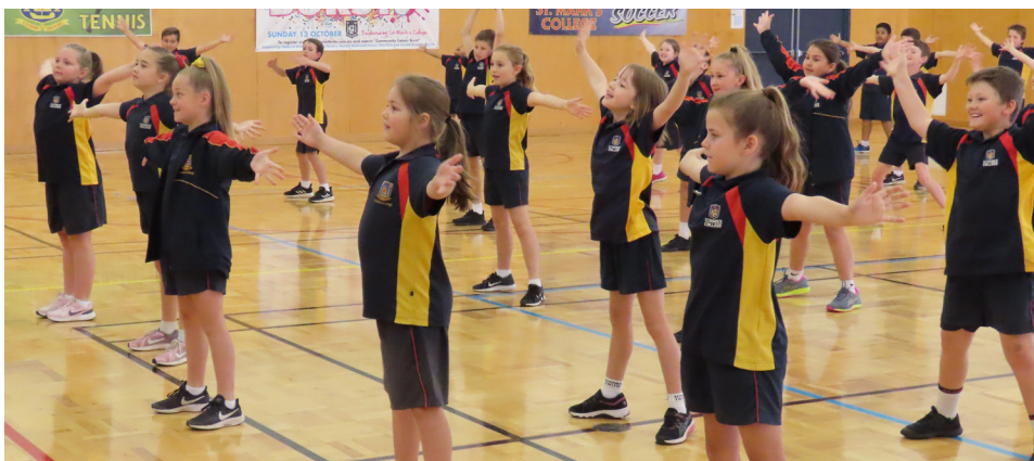
Year 3s enjoying the Dance sessions with Hip Hop Bounce as part of the PE curriculum