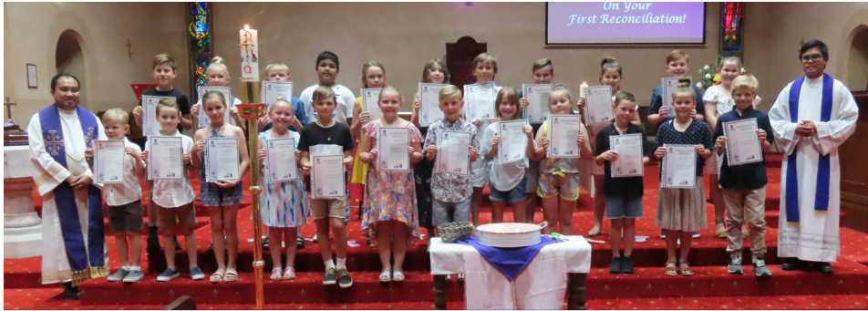
Our Year 3s celebrating their Reconciliation this week