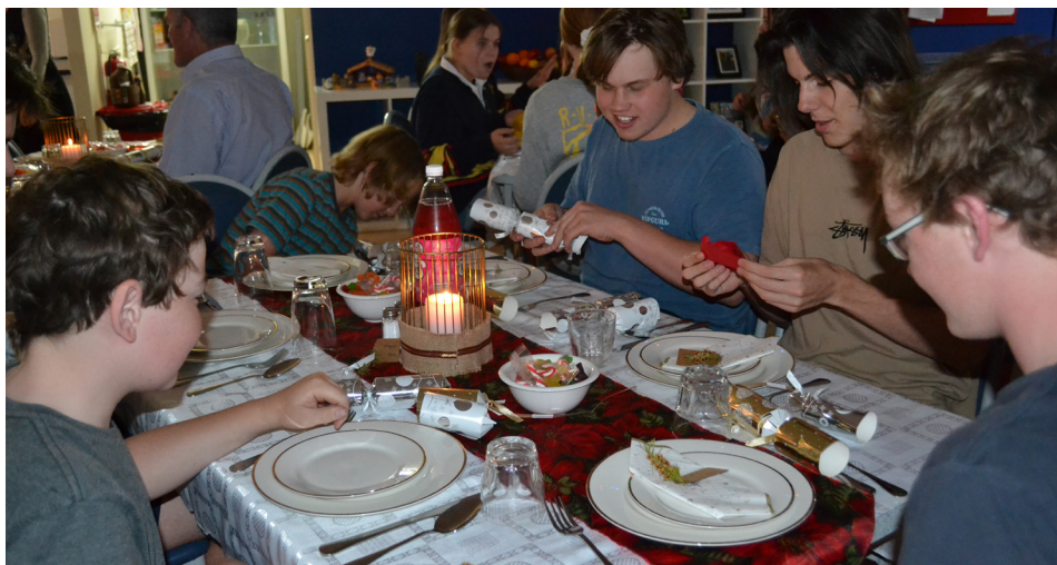
SALESIAN HOUSE: Enjoying Christmas Dinner at Salesian House