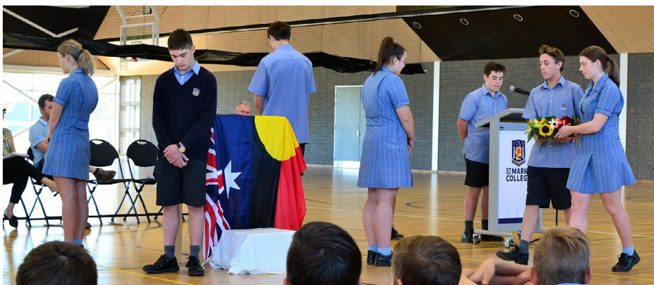
A time for reflection at Bosco Campus on Remembrance Day

was from one unlikely gentlemen who wished me Merry Christmas and thanked me for my “enthusiasm and speeches”. I will keep that card and treasure the compliment and know that there is a special spirit in Salesian House. They made this moment so special together. Happy Christmas.