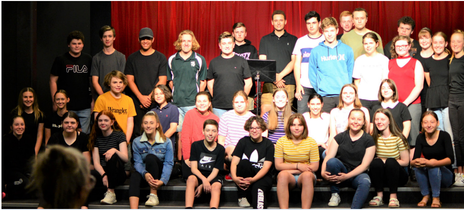
Our talented music students on show for the end of year concert

Last Thursday night 50 of our Year 8, 9 and 10 students took to the stage in the Bishop Gallagher Centre to perform in our annual End of Year Music Concert for family and friends.