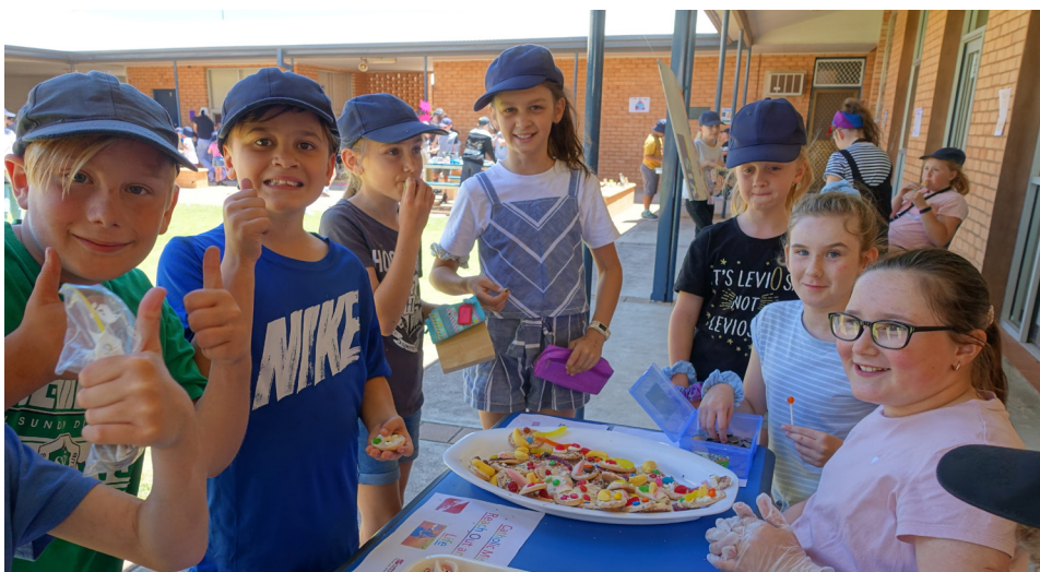
Our Year 4s give a thumbs up for Mission Gala Day!

There was a joyousness about Gala Day and a celebration at the Boarding House. We heard music and listened to a profound story. The College Board made certain that all will be well.