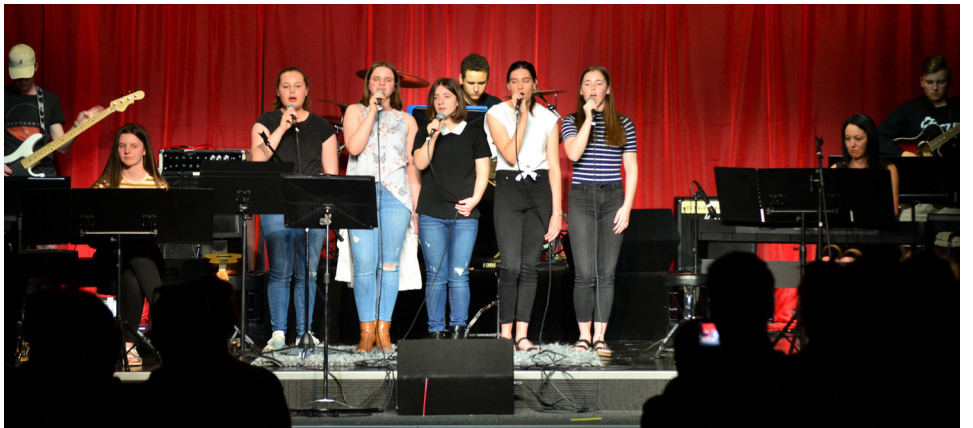
The Year 10 Class Band