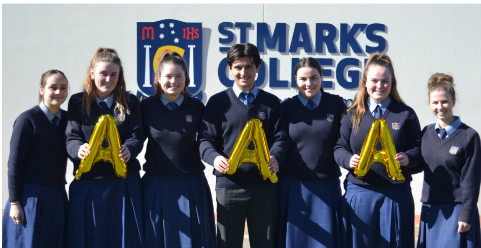
RESULTS: 51.43% of Year 12s achieved a grade in the A band (A+, A or A-) in this years Research Project with 7 students achieving the ultimate A+ result!