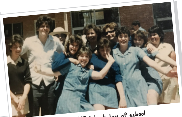
Class of 1984 last day of school