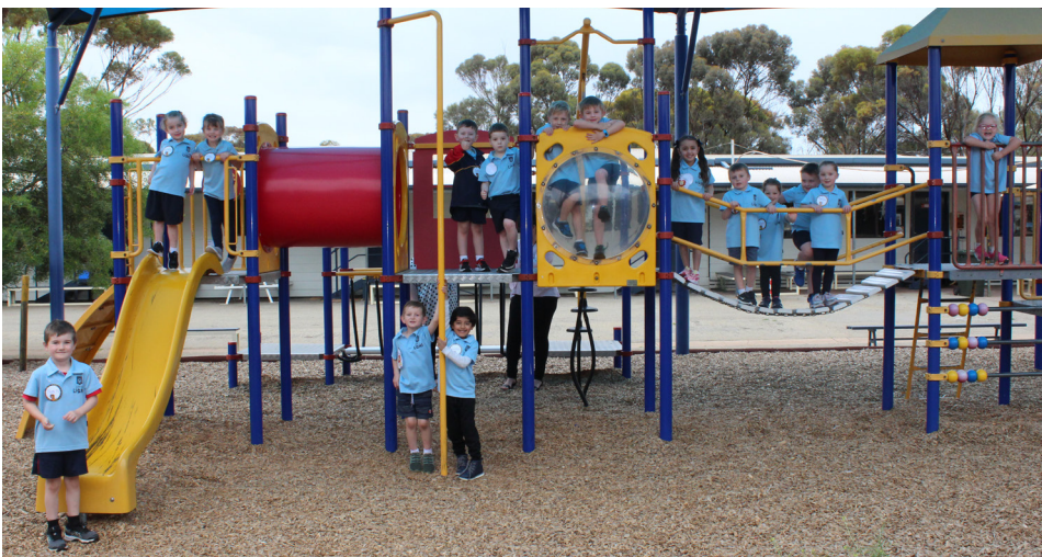
READY, SET, GO: Our Little Lions are ready and excited to start school.