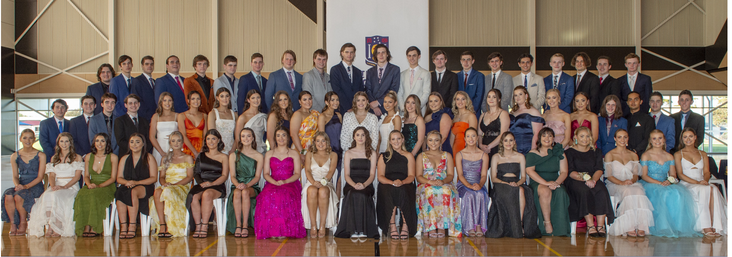
CLASS OF 2020: Our Year 12s celebrated the end of their schooling with a presentation in the St Mark's Sports Centre