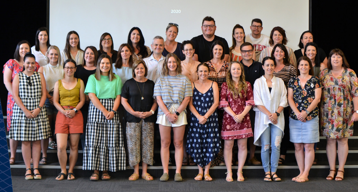
Our staff Old Scholars' on the final day of school

Greetings to our alumni, you are remembered and always welcome.