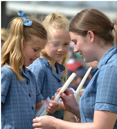
CANDLE: As a College we farewelled our Year 12s at the traditional candle Mass