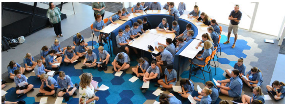
The Year 7s were supported by teachers in the start of their high school journey