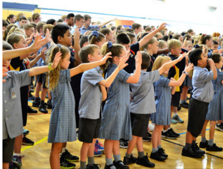
A special blessing