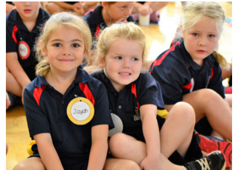
Our Receptions first Opening Mass