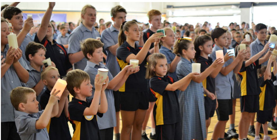
Candles were blessed to celebrate the start of the school year

Our year begins. The community celebrates scholarship and we join for Mass. Parents get involved and the staff attend an historic moment.