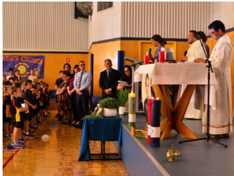
Standing for the readings