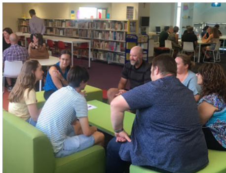
Year 12 Leaders met with parents and staff