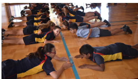
Working in partnership