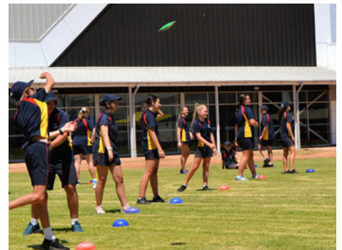
Athletics practice on the oval