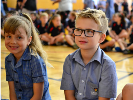
Waiting patiently for the Mass to start

Our community gathered and the beginning of the school year was celebrated with the Opening Mass.