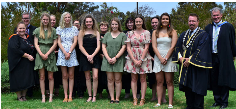
Celebrating the Dux Assembly