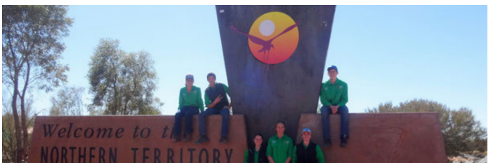
Our Year 12 Agriculture students embarked on a trip to remote stations in South Australia and the Northern Territory