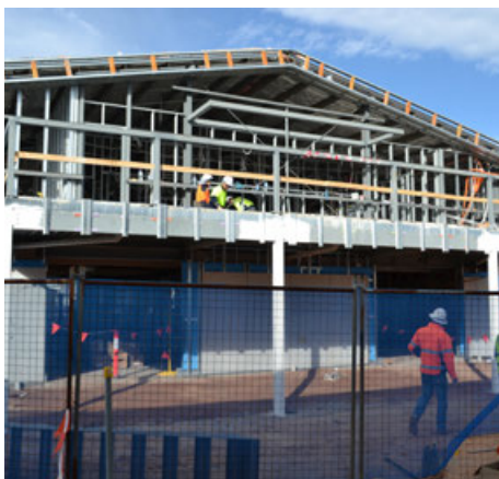
A new mezzanine floor has been built into the Science and STEM Centre