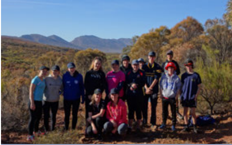
Our new Outdoor Ed course took students to new heights in the Flinders Ranges

Our horizon is continuously changing as the new Sports Centre and Science and STEM Centre are built. Both due for completion in Term 3, students and staff are excited to see the completion of these new state of the art facilities!