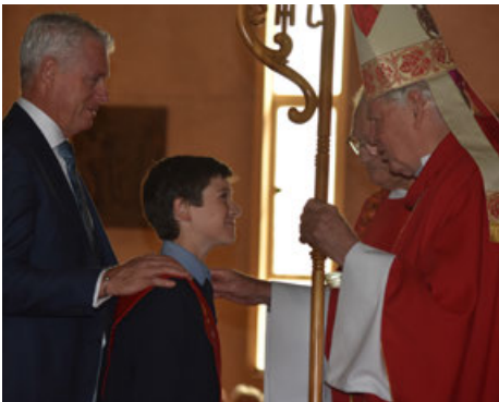
The College and Parish (and many Old Scholars!) came together to celebrate the Confirmation of many of our Year 7 students.