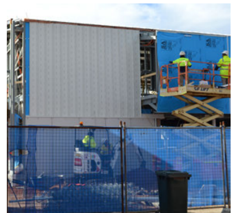
The new exterior being added to the Science and STEM Centre