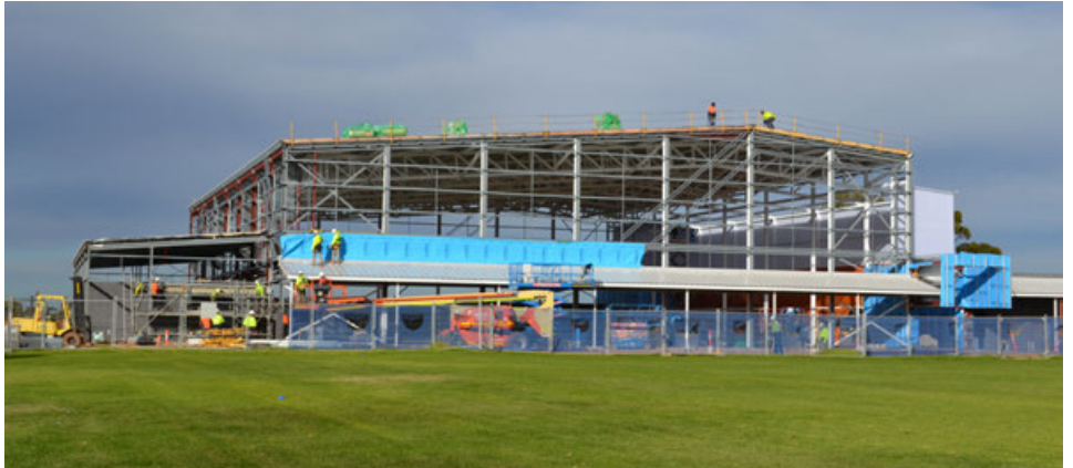
The new Sports Centre is taking shape