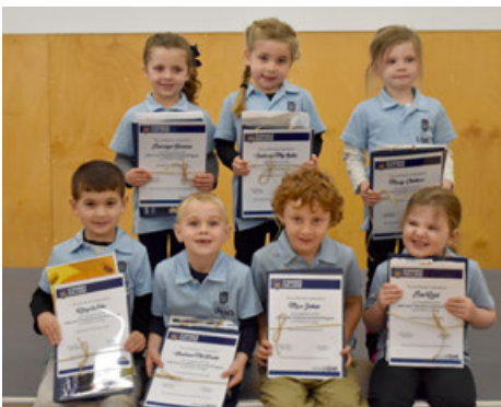
Our Little Lions graduated, ready to start school in Term 3