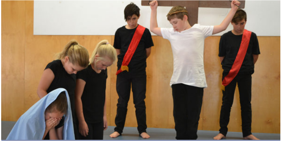
The tradition of the Benedict Easter Re-enactment continues with our Year 5s and 6s presenting the Stations of the Cross for the students, staff and College families