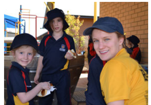
Feast Day was celebrated in Term 2 with Mass, a sausage sizzle and plenty of fun activities for students, from the youngest to the oldest!