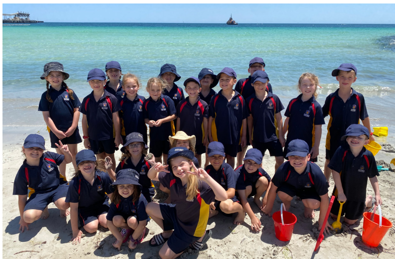
EXCURSION > 1 Green cooled down at the beach in Wallaroo.