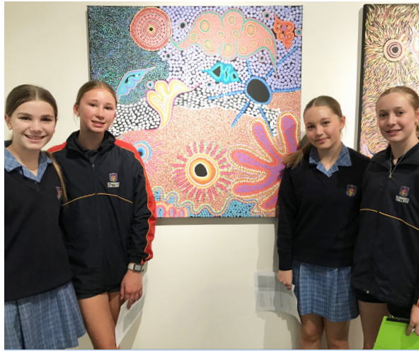
EXHIBITION > Year 7 students were treated to a guided tour of the 'Saltbush Exhibition' at the Art Gallery.