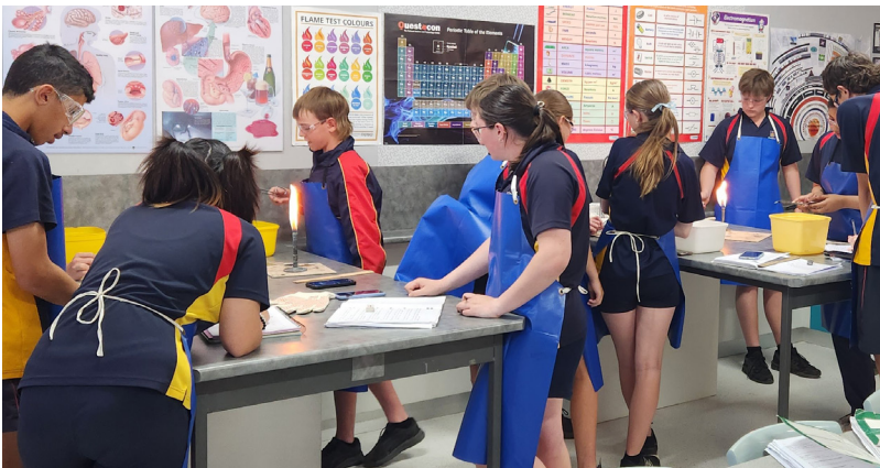
SCIENCE > Year 8 students completed a practical where they simulated weathering, by heating a small rock until it was glowing red and then cooling it quickly in a water bath – and repeating these steps many times to mimick weathering on rocks from the surface of the earth.