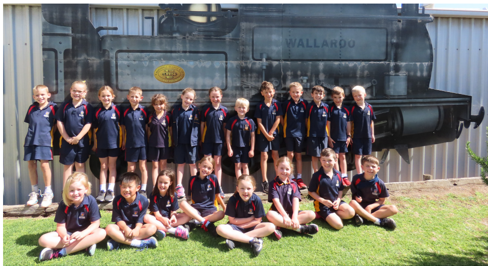
EXCURSION > 1 Blue enjoying their time at the nautical museum on their excursion to Wallaroo.