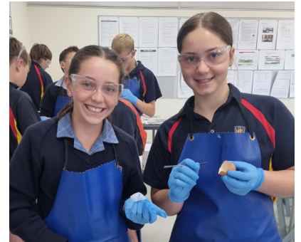
AGRICULTURE > As part of their learning about poultry Year 8s conducted an egg dissection, exploring how to identify different parts of an egg and how, if fertilised, they support the growth of a chick.