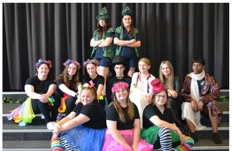
DRAMA > Year 10 Drama students performed Hoodwinked to primary students as well as friends and family.