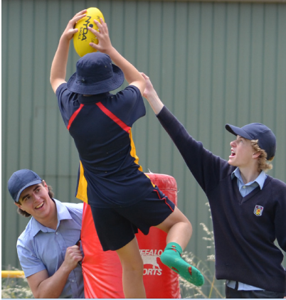
SPORT STUDIES > Year 11 students worked in groups to design a coaching session in a specific sport for Year 5s participation.