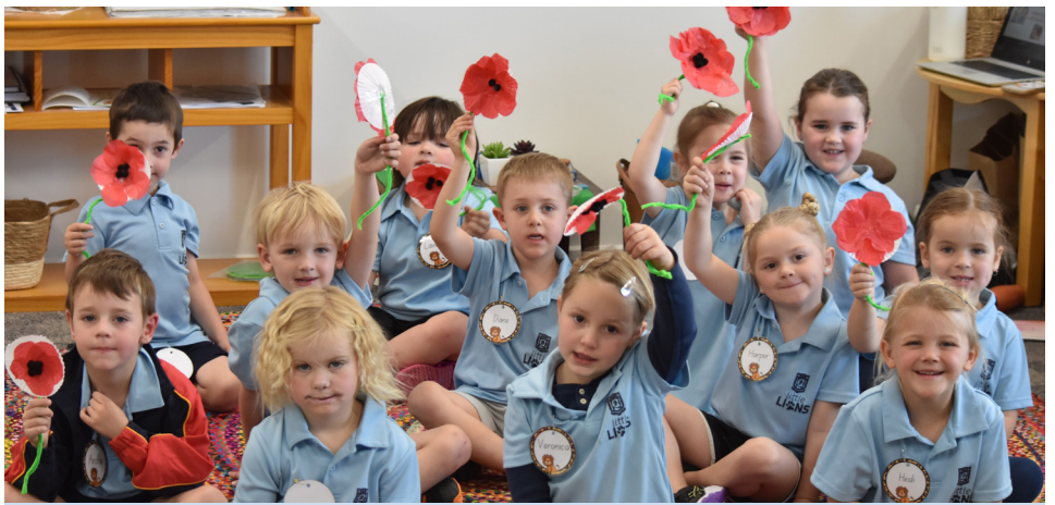
Our Little Lions made poppies for Remembrance Day