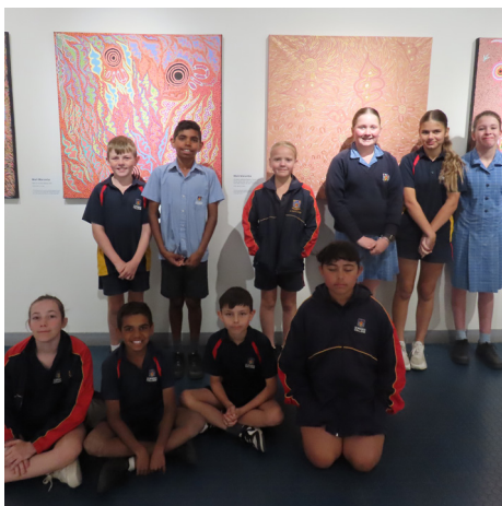
EXHIBITION > Students were treated to a guided tour of the 'Saltbush Exhibition' at the Art Gallery.