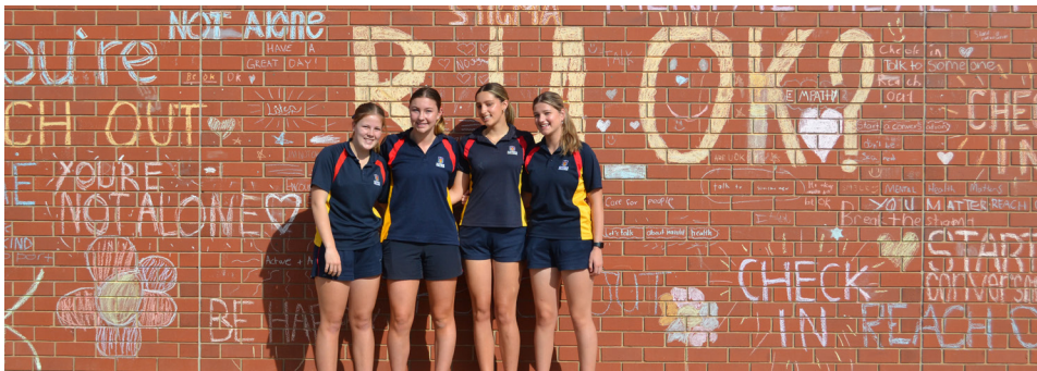
Students wrote messages of encouragement on the Community Wall at Bosco Campus