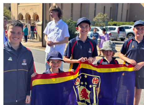
Carrying the College banner