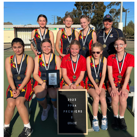
Congratulations to our G Grade Premiers