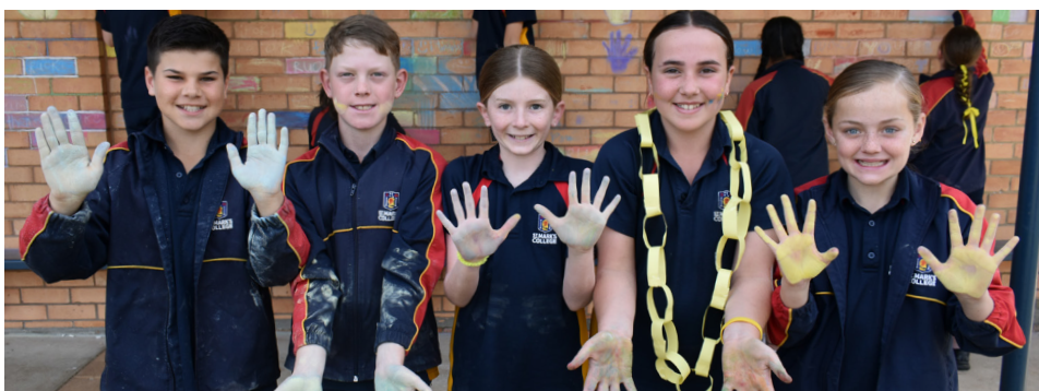
Students wrote messages of encouragement on the library wall at Benedict Campus