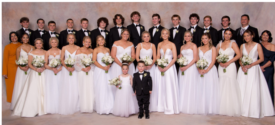
Congratulations to the Debutantes and their partners at the Blessing of the Fleet Ball