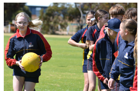
Bosco students competed in 'old school' games during WRAP lesson