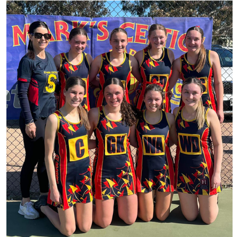
Congratulations to our C Grade Premiers