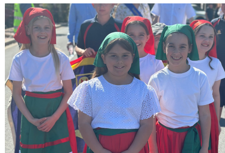
Year 3s dressed as 'Italian girls' in the procession