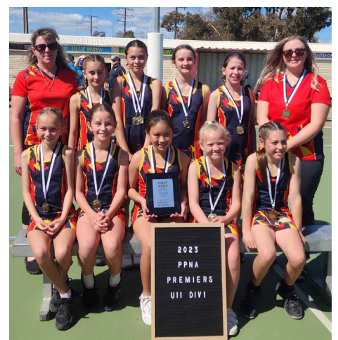
Congratulations to our U11 Div 1 Premiers