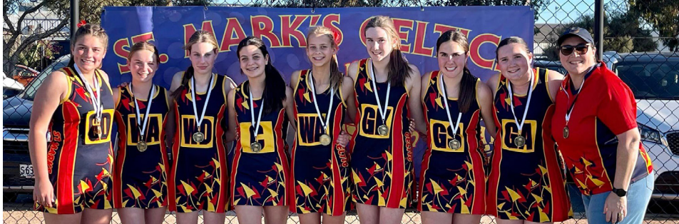
Congratulations to our D Grade Premiers

Congratulations to our St Mark's Celtic Netball Premiers for 2023: