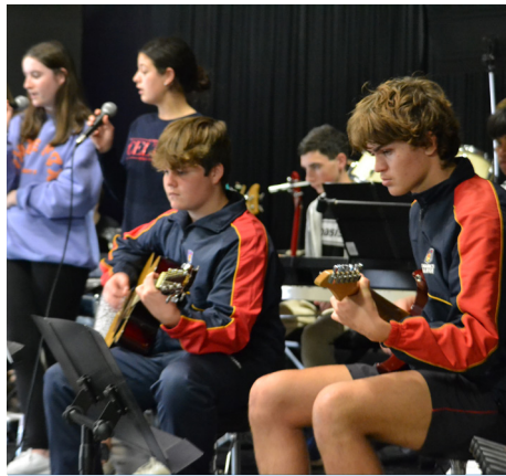
MUSIC > The talents of our Music students were showcased at the end-of-semester concert with students, staff and families treated to a number of performances