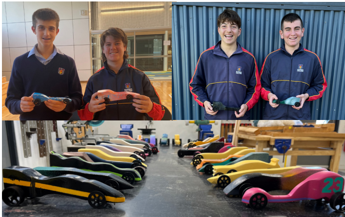
DESIGN + TECHNOLOGY > Year 9 students had the opportunity to race the CO2 Dragsters they designed and created.