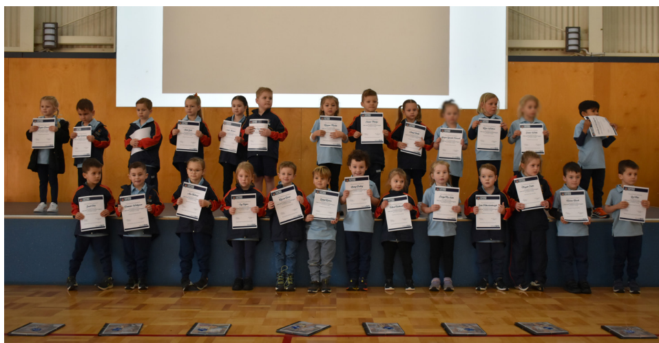
LITTLE LIONS > Our Little Lions were presented with their certificates of completion at the Presentation Assembly today