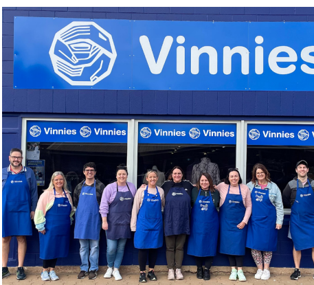
Staff visited our local Vinnies to lend a hand