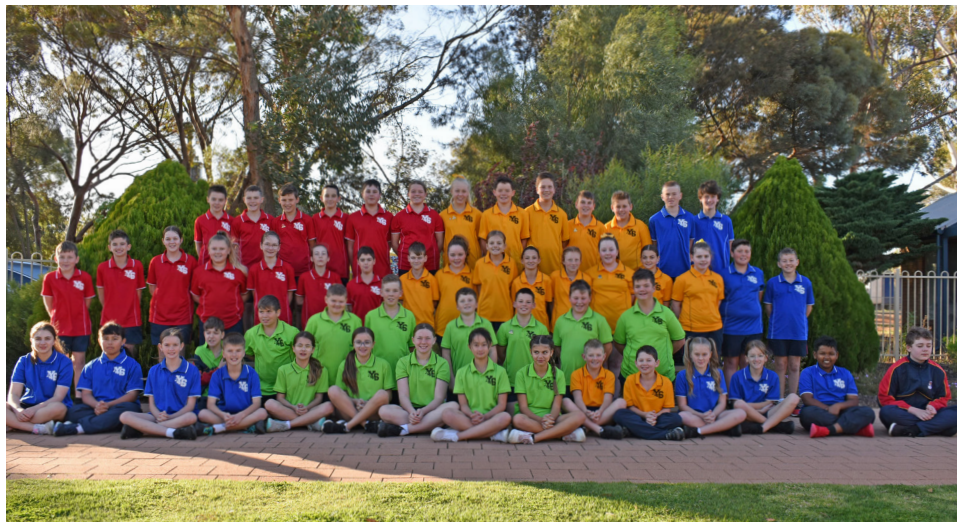
YEAR 6 > Our Year 6 students wearing their commemorative tops