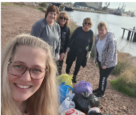
Staff 'planking' - walking and picking up rubbish

On Friday morning each member of our staff went out into our community to be of service in some way. Some planted trees, volunteered at Vinnies and Goods on Gertrude Op Shops, some cooked for Fred's van while others cleaned up rubbish around Port Pirie. The staff were enthusiastic about the difference they had made to our communities in such a short time and connected their efforts the Catholic Social Teachings.