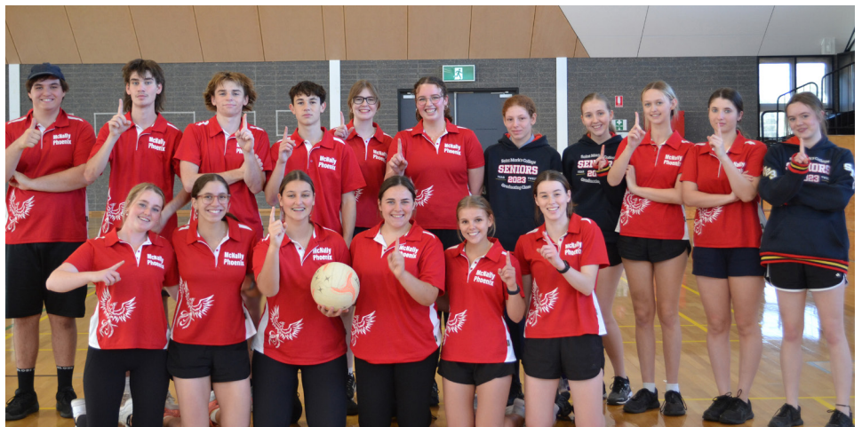
YEAR 12 > Our Year 12s competed in a House VS House Netball competition recently with McNally taking out the win!