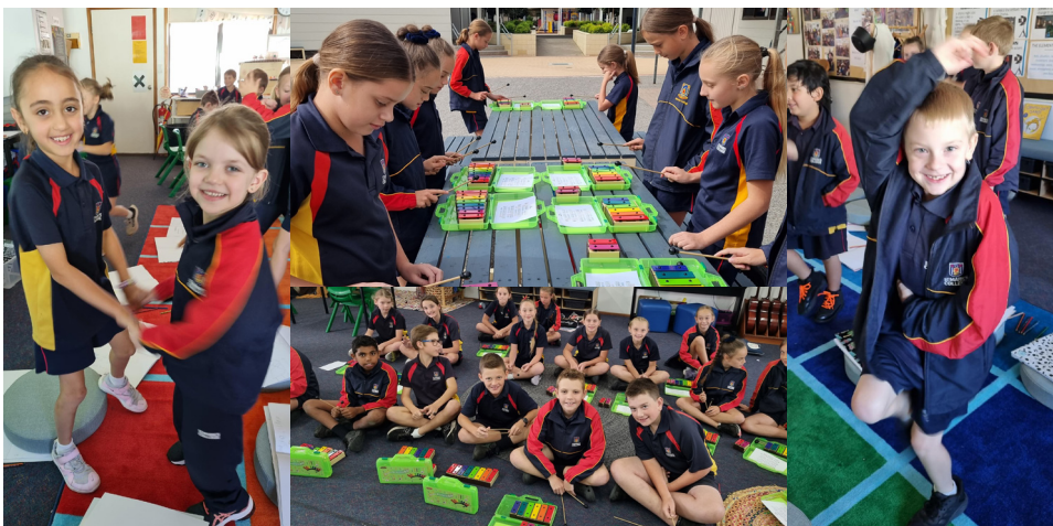
PERFORMING ARTS > The students have been learning and having fun in Music, Dance and Drama