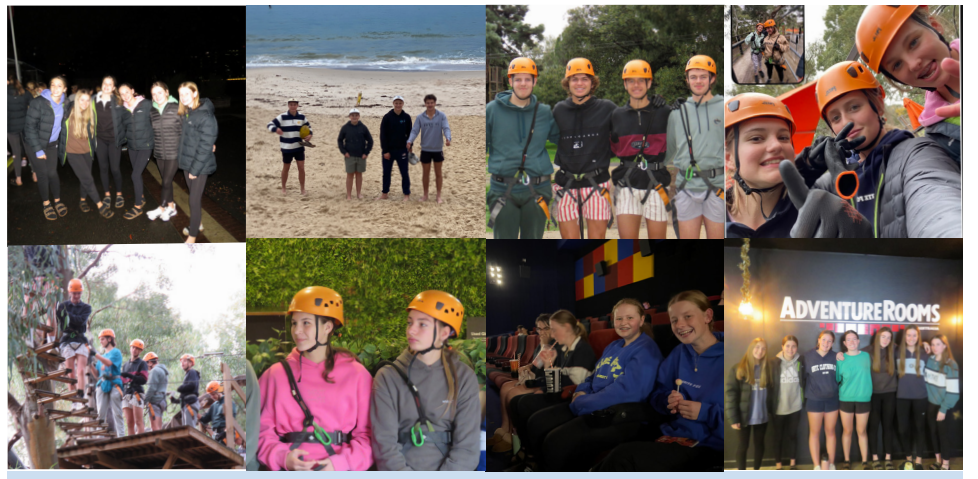
YEAR 10 CAMP > Treetop climbing, ziplining, escaping rooms and gaining valuable learning experiences at the Adelaide Gaol and the Holocaust Museum were all part of the adventure of Year 10 camp last week