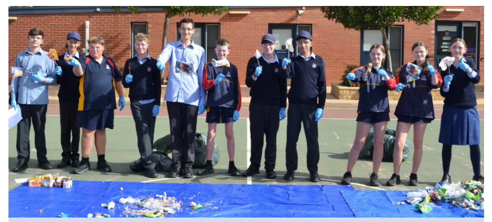
STEM > Our Year 8 Environmental Studies students took a deep dive into waste at the College, finding that just under 50% of what ends up in rubbish is actually recyclable or compostable! The students are now working on an action plan to help combat and reduce the amount of waste from the College going to landfill.

AGRICULTURE > Ag students gained first hand industry experience at life on a station when they visited Wirraminna Station