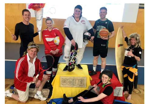
Our Olympic heroes who participated in the Torch Relay