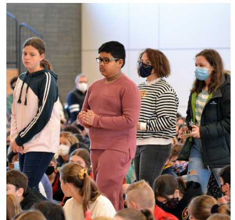
Bringing forward the gifts of bread and wine