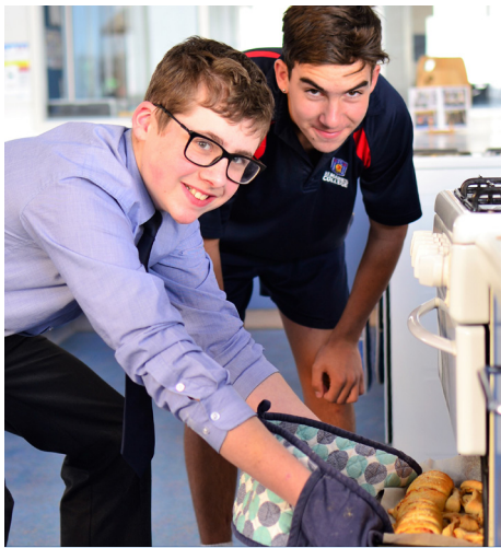
FOOD TECHNOLOGY > Angus F and Angus T take pizza scrolls from the oven