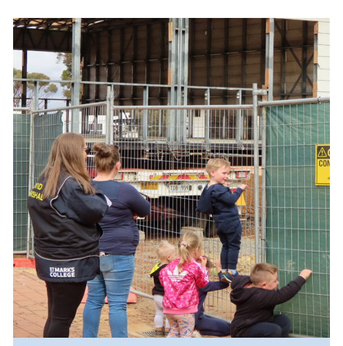
Building development captivated the attention of our 'Mini Mark-ers'