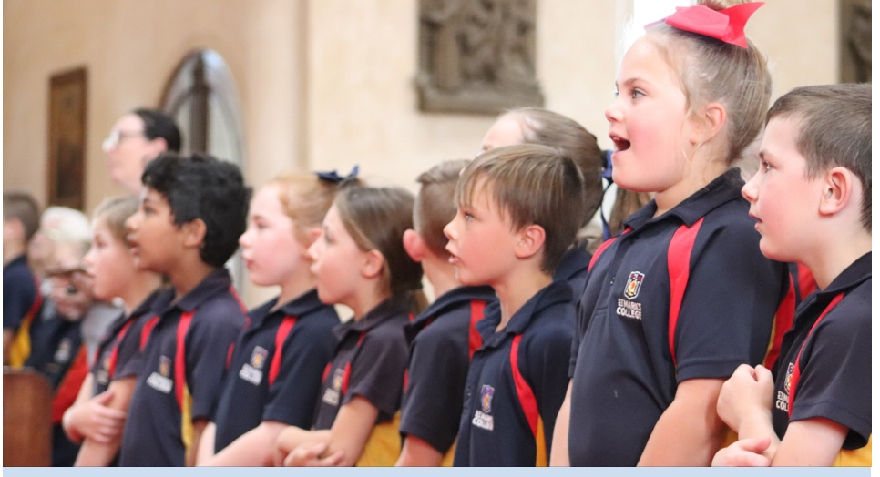
Year 2 students singing at Mass at the Cathedral