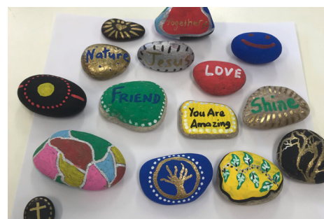
Staff enjoyed expressing their creative side in the 'Spirituality of Art'