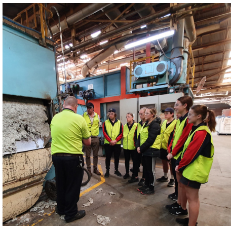
Wool at the end of the carbonising stage before the dust and carbonised veg matter is removed