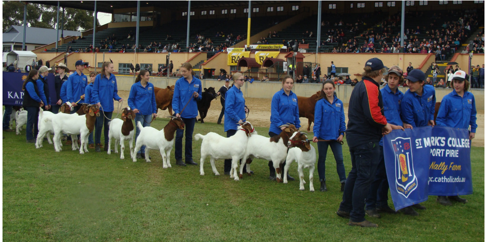
Students leading the goats at the Grand Parade at the Adelaide Show