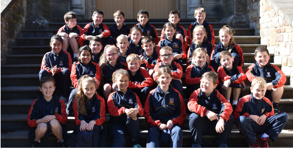
On the steps of St Aloysius Church, Sevenhill