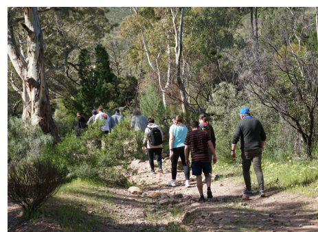
Walking at the Napperby Scout Camp