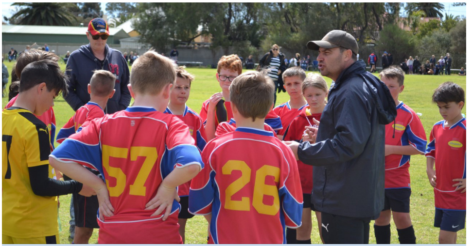
Our winter sports teams hit finals time

Grand times in sport and a fairy tale moment. Staff reflection, the Adelaide Show and primary voices celebrate springtime renewal.