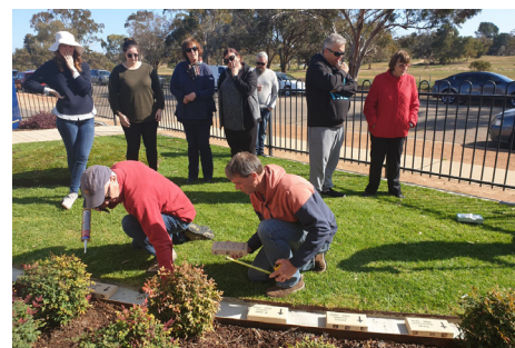
Staff worked on the new Memorial Garden at the College