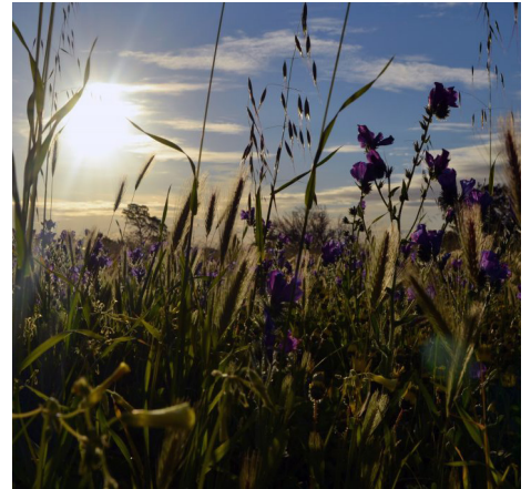
'Golden Shine' - Mae Caspers