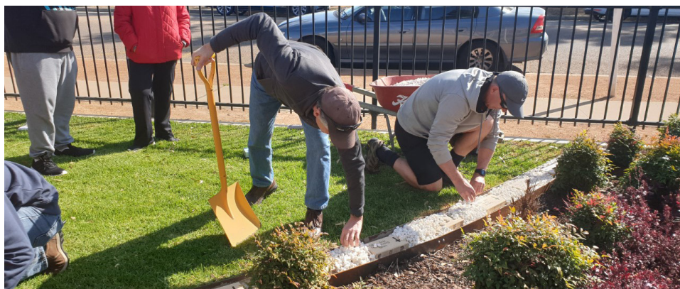
Placing the memorial tiles in the new Memorial Garden