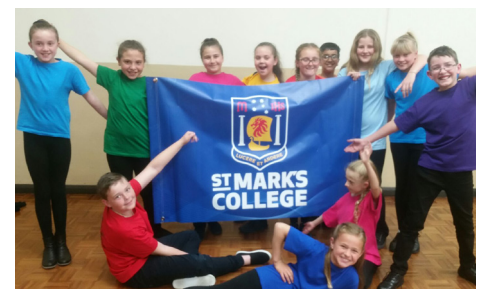
Our Benedict Choir students performing at the Festival of Music