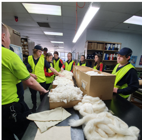
Students looking at the wool in the final stage after it has been washed and carbonised