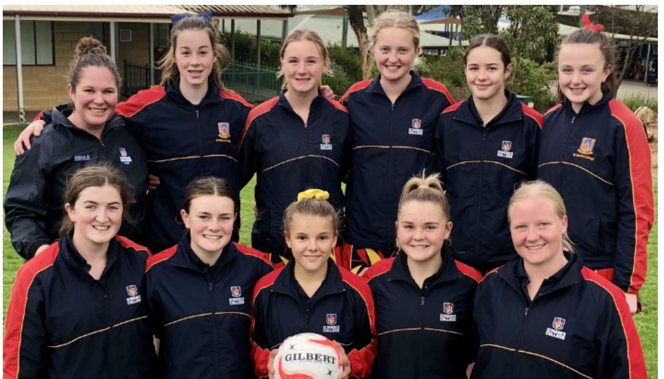
The 8/9 Knock Out Girls Netball Team played really well throughout the competition, finishing fourth overall.