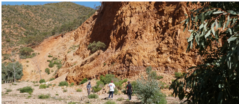
Admiring the enormity of God's creation