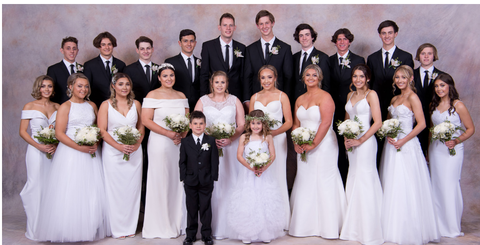
The Debutantes of the Blessing of the Fleet

experience. A feature was a series of workshops in the afternoon. These included a Memorial Garden construction to honour those from our community who have passed while at the College; a walk to Napperby to deepen connection to nature and the moment. There was a workshop on the Spirituality of Wine (truly, it was serious – wine tasting with biblical references). There was a construction of an Indigenous Garden and a lecture on Trauma in Children. There was a meditation around art and spirituality and a Music creation workshop where a song was composed to farewell the Year 12s. There was a gathering of past staff and an exploration of the History of the College. Our staff valued their experiences. They were touched by prayerful memory, quiet creativity and the value of being together. This school is a place of great hearts. The staff hearts had a chance to be renewed on a day of reflection.