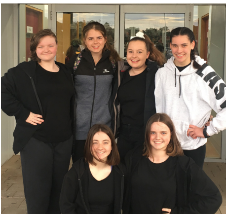
The Bosco Vocal Group opened the A Grade Netball finals singing the National Anthem