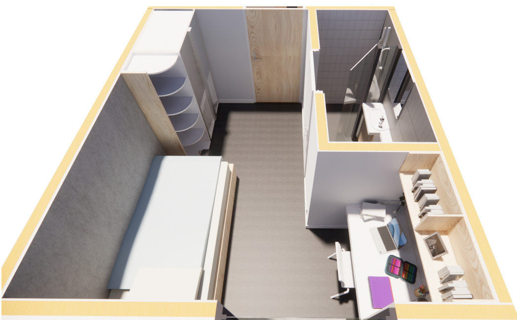
Student bedroom and ensuite

With our five-day boarding, students gain the benefit of extensive curriculum choices, including VET and agricultural courses, whilst being close enough to home to stay connected with family and community at weekends. Our boarding students are an important part of our community, and we are committed to ensuring the continuation of boarding at St Mark's and the provision of the best facilities. Consequently, we have been working with architects Russell and Yelland on the design for a new facility and work should begin at the end of this year, with a view to opening in 2025. Students will benefit from individual air-conditioned study bedrooms with ensuite facilities, arranged in pods around a central courtyard for recreation.